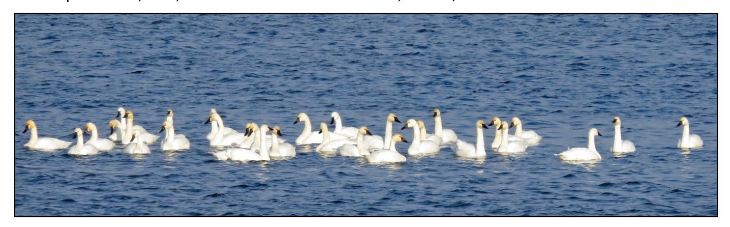
A flock of 31 Tundra Swans, Eagle Creek Park, Marion Co., 28 Nov.

Tundra Swan – 20 counties reported birds in November. High counts: Goose Pond FWA, Greene, had 74 on 10 Nov. Marquette Park, Lake, had 65 on 9 Nov. Lake Simonton, Elkhart, had 51 on 12 Nov.