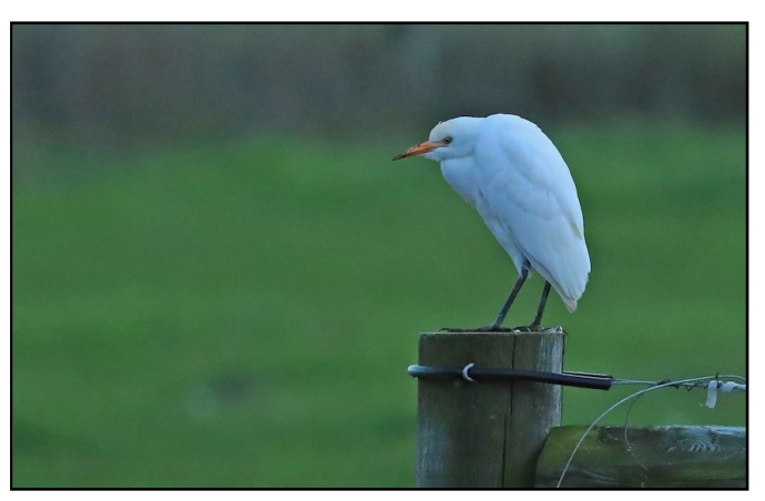
Late Cattle Egret in Elkhart Co., 3 November.