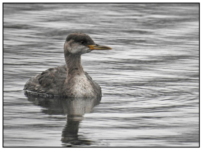
Red-necked Grebe in Clark County on 14 November.