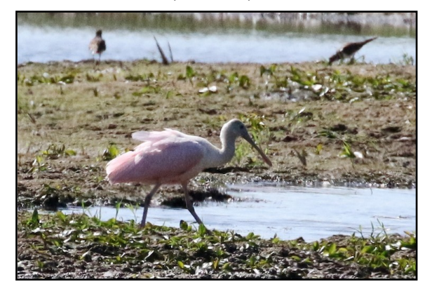
Indiana's third record for Roseate Spoonbill, 4 Sept., 2018.

Swallow-tailed Kite – Clinton County site was visited by many birders 26-31 Aug. A single bird was also reported in nearby Tippecanoe County. IBRC accepted an August report from St Joseph County.