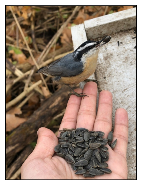
A curious Red-breasted Nuthatch feeds from the hand in Tippecanoe County, 25 November.