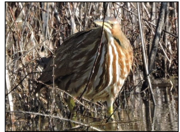
American Bittern at Goose Pond FWA, Greene, 21 November.