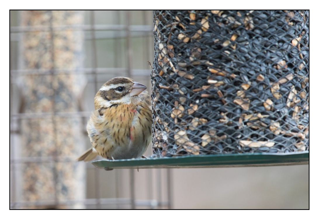
Late Rose-breasted Gosbeak at private feeders in Beverly Shores, Porter, on 23 November.