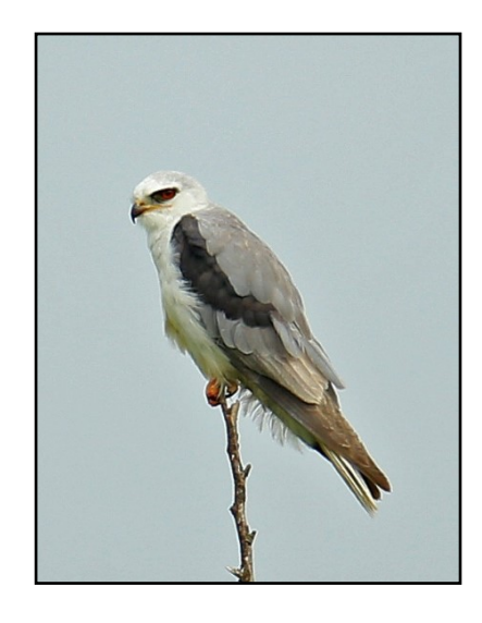
White-tailed Kite at the Indiana Dunes Birding Festival, Porter Co. The bird appeared May 18 and remained for 9 days.

Note that not all submissions from 2018 have been voted on yet. The committee thanks all those who submitted records for review.