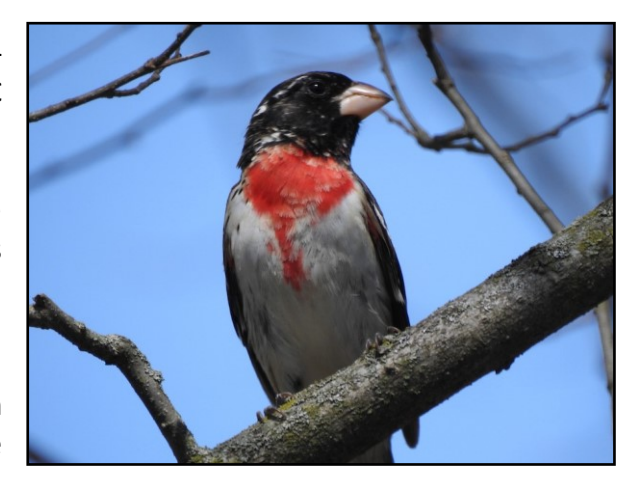
Rose-breasted Grosbeak by Ed Powers, May 2018 in Allen County.

Weather conditions were similar to 2017 with an average high temperature of 74.95 F and average low of 60.82 F across the state. However, there was a significant difference between the northern and southern parts of the state with some counties hovering either side of 90 degrees for a high while others had highs only in the 50s. Much like 2017, participating counties