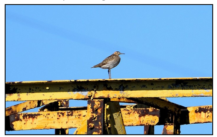
Late Upland Sandpiper at State Line Flats, Lake, 29 Sept.