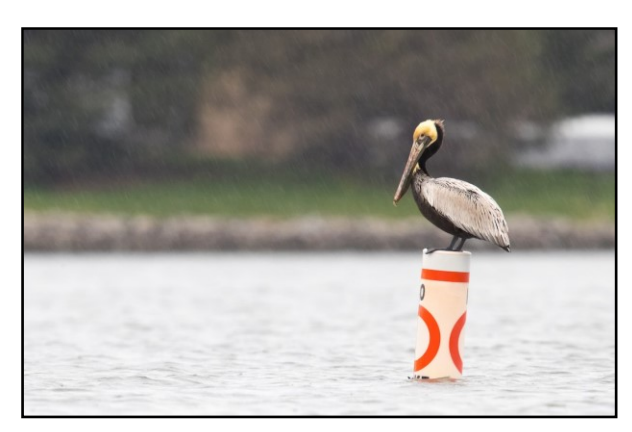
Brown Pelican at Heritage Lake, Putnam Co., 23 April 2018.

For more information about our committee's purpose and procedures, feel free to browse our Bylaws.