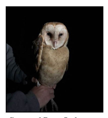
Captured Barn Owl at Yellowwood banding station, 30 October.