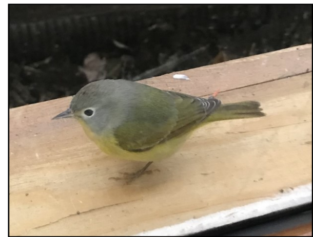
One of many tardy Nashville Warblers this fall. on 9 Nov in Vigo County.

Black-throated Blue Warbler – Victor Duda photographed 1 at his feeder in Porter County on 18 Nov.