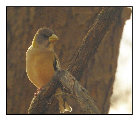
Evening Grosbeak at Potato Creek SP feeders, St. Joseph, 25 November.

Common Redpoll – High count of 26 at Indiana Dunes SP, Porter, on 14 Nov by Brad Bumgardner. 34 birds were reported along the lakefront. Rodney Strayer had 1 in Noble County on 13 Nov. 3 birds were noted in St. Joseph County.