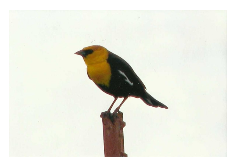
Figure 11. Yellow-headed Blackbird, Limberlost Swamp Jay 30 April