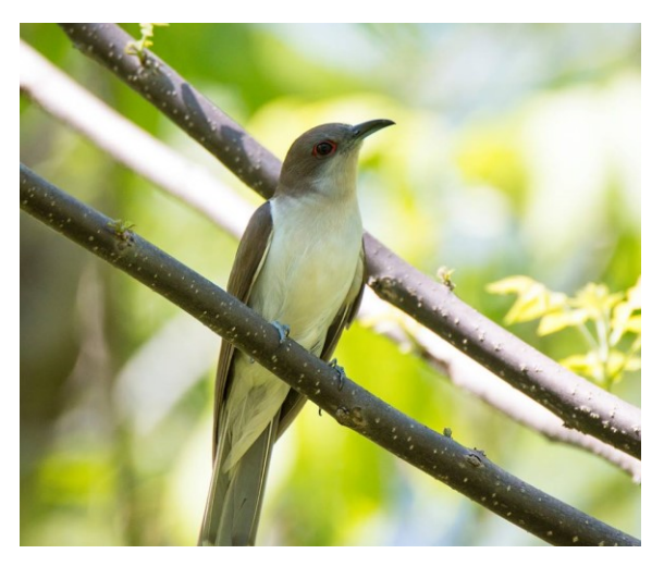
Figure 7. Black-billed Cuckoo, Potato Creek State Park, St. Joseph 23 May.

Yellow-billed Cuckoo - An incredible 325 were reported for the season, the largest spring total ever recorded. The peak daily count was 8 at Harmonie S.P. at Patoka NWR, Gibson , on 30 May. (Evan Speck).