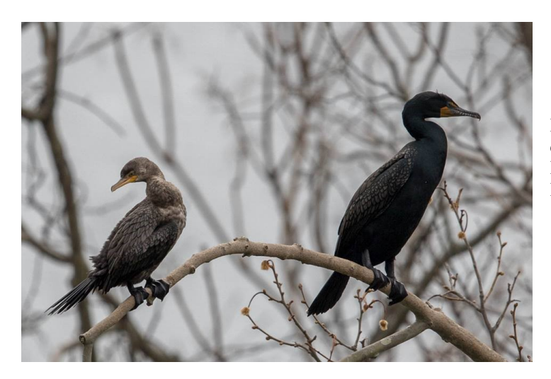
Figure 2. Neotropic and Doublecrested Cormorants, Eagle Creek Park, Marion 15 April