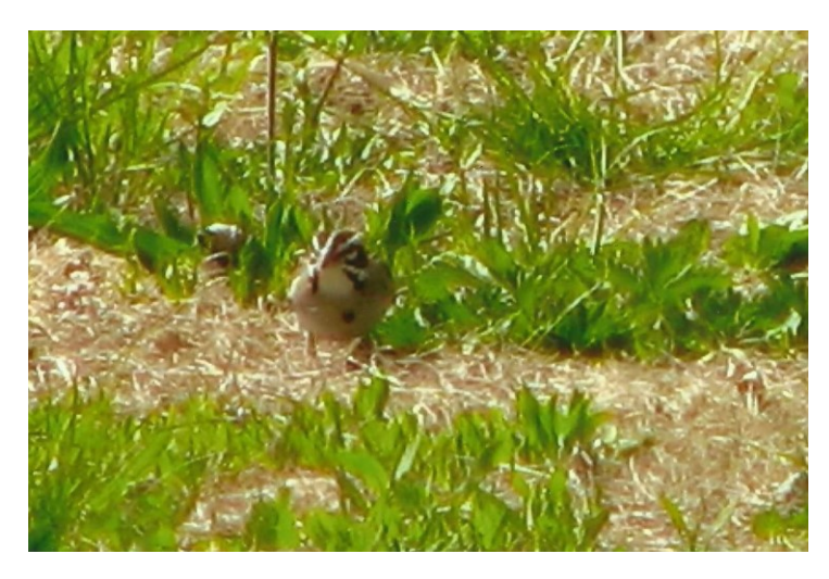
Figure 10. Lark Sparrow. Salamonie Reservoir, Huntington 2 May.