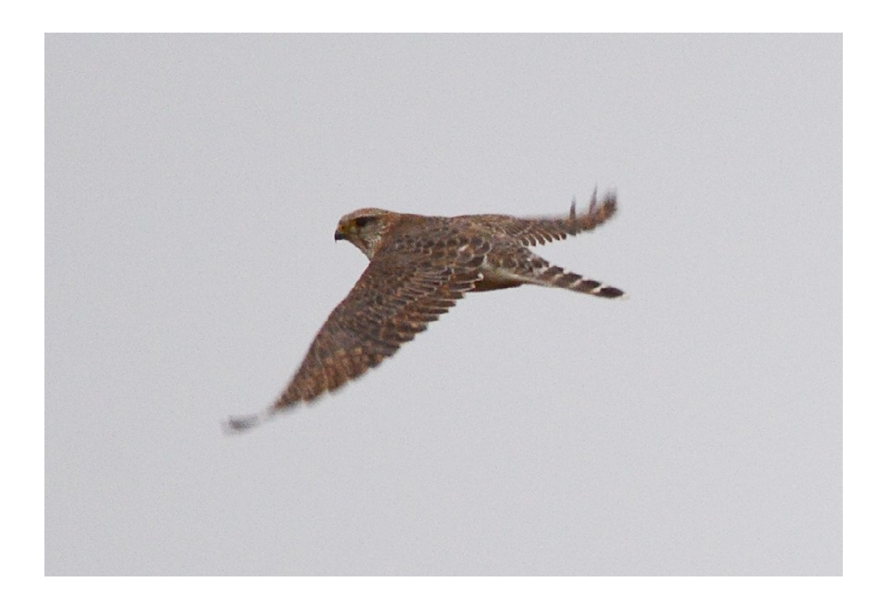
Figure 4. Merlin - Goose Pond CBC, 17 December 2014~ Steve Bell