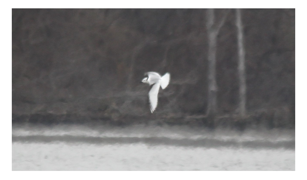
Figure 8. Black-legged Kittiwake - Sullivan County CBC, 14 December 2014