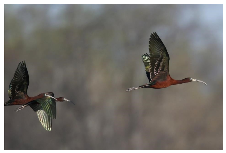
Figure 3. Glossy Ibises, Cane Ridge, Gibson 11 April