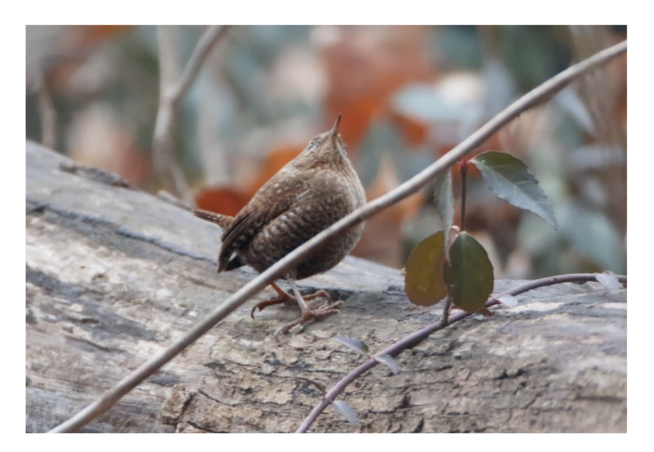
Figure 14. Little Gull – Sullivan County CBC, 14 December 2014