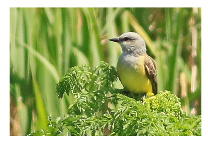
Figure 8. Western Kingbird at Grant Street Marsh, Lake 23 May.

Western Kingbird – In addition to birds possibly nesting again at Evansville airport, Goshen birder Robert Guth discovered one at the Grant Street Wetland, Lake , during the morning of 23 May. The bird then disappeared, but was relocated later that morning by Leland Shaum's group. It lingered through at least 28 May (Kim Ehn) and was seen by many.