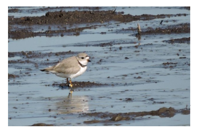
Figure 4. Piping Plover, 26 April Goose Pond, Greene

Piping Plover - A banded bird at Goose Pond, Greene , on 26 April (Jim Brown et al.) proved to be from the Great Plains population (likely North Dakota).