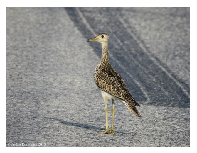
Figure 5. Upland Sandpiper, Grissom Airbase, Miami 1 May

Upland Sandpiper - Two returned to the Grissom Air Force Base, Miami , on 1 May. (Landon Neumann) The season's only other report consisted of a singleton in eastern Newton , on 12 May. (Doug Gerbracht)