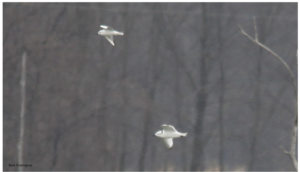
Identified by photography: First-cycle Black-legged Kittiwake (below) with Bonaparte's Gull,17 December Turtle Creek Reservoir, Sullivan

<u>Little Gull</u>:- The fall first-cycle bird at Turtle Creek Res (first reported 2 November 2014) was still present on 1 March (David Ward). This remarkable 119-day visit is unprecedented in the Hoosier record book.