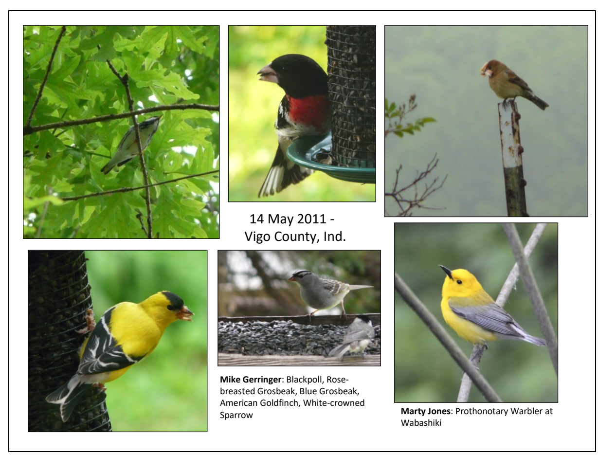
Figure 8. Vigo County Count 2010 BMDBC