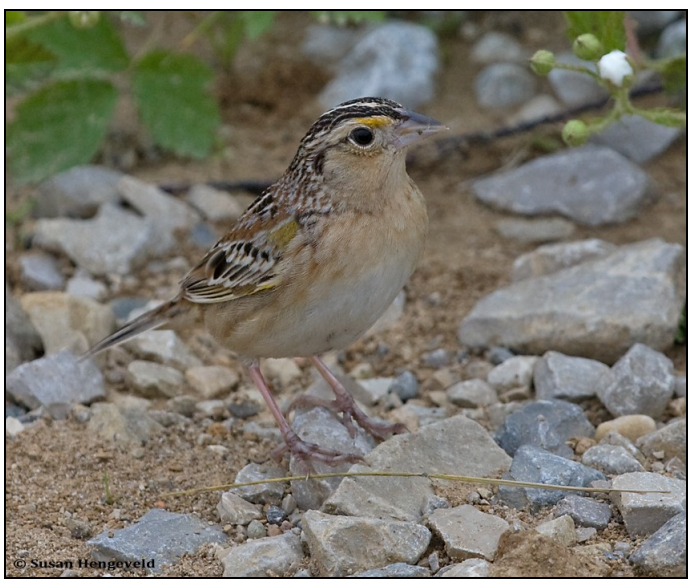
Figure 3. Grasshopper Sparrow, Greene Co., 14-May-2011

Thanks to all of the compilers and observers for their donations of money and time on the count. I look forward to your participation again next year.