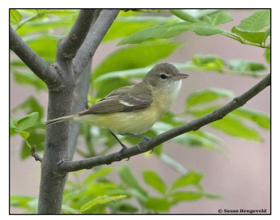
Figure 1. Bells Vireo, Greene Co. 14-May-2011, by Susan Hengeveld.

The Big May Day Bird Count was conducted state-wide on Saturday, May 14<sup>th</sup>, 2011. The objective of the BMDBC is to count the number of birds of each species occurring in a participating county area from midnight to midnight on the second Saturday in May. The ensuing data snapshot provides a valuable scientific record of the resident and migratory bird populations occurring each year in Indiana. After two years of generally strong winds for the Big May Day Bird Count, the weather was milder with the average high temperature across the state at 68°F and average low at 55°F. Cloud cover was consistently present across the state, and counties in the north reported rain.