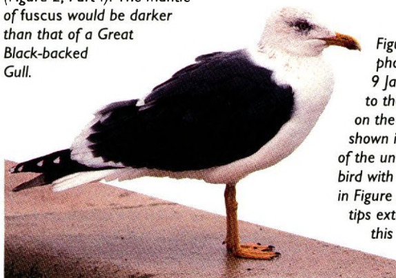
ROBERT H. LEWIS

Figure 14. Another probable North American L. f. intermedius , at Point Lookout, Nassau County, New York, 28 September 1985 (immediately following Hurricane Gloria). Compare the size and shape of the Lesser Black-backed Gull with that of the Great Black-backed Gull and the Herring Gulls. Note the small size (probably a female), long wings and generally attenuated shape, thin long bill, and yellow legs. Although part of the wing is in shadow, there appears to be little contrast between the primaries and the rest of the wing. The mantle color, which is the same as that of the accompanying Great Black-backed, matches that of intermedius from the west coast of Sweden (Figure 2, Part I). The mantle of fuscus would be darker than that of a Great Black-backed Gull.