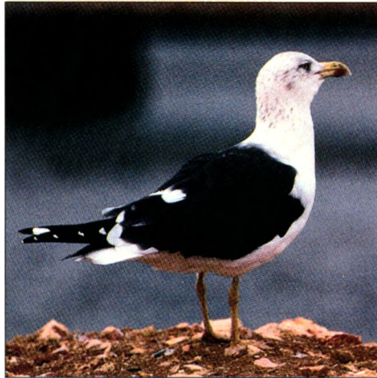
ROBERT H. LEWIS

Figure 11. A close-up of the intermedius shown in Figures 3 and 9, photographed 9 January 1994 at Lagos, Portugal. Compare this photograph with the birds pictured in Figures 7 and 15. All three are relatively dark birds, but this bird is not as gray; it is blacker. Also compare the size of the unworn white primary tips and the length of the wings in the three birds. In this bird, the wings are extremely long, and the end of the tail reaches the tip of the fourth primary. In the birds pictured in Figures 7 and 15 the unworn white primary tips are larger, and the tip of the tail reaches, or is near, the white tip of the third primary.