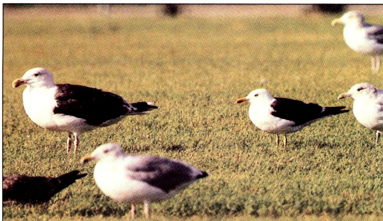
PETER W. POST

Figure 13. Another apparent North American intermedius photographed at the Pompano Landfill, Pompano, Broward County, Florida on 10 March 1990, the same day as the intermedius pictured in Figure 4 and Figure 5, Part I. If we allow for the slight underexposure of this photograph, the mantle color is correct for intermedius . Also note the small size of the white primary tips, and the long wings that extend well beyond the tip of the tail.