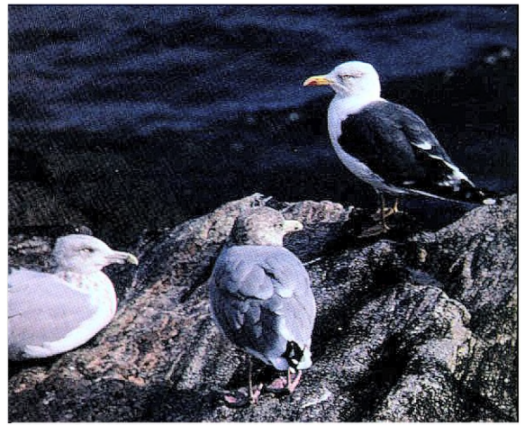
Figure 1. A definitive basic (winter) plumaged L. f. graellsii with Herring Gulls for comparison at the Chesapeake Bay Bridge and Tunnel, Virginia, 26 October 1985. Note the back and wing color and large white primary tips. The amount of head streaking is less than in most basic-plumaged graellsii.