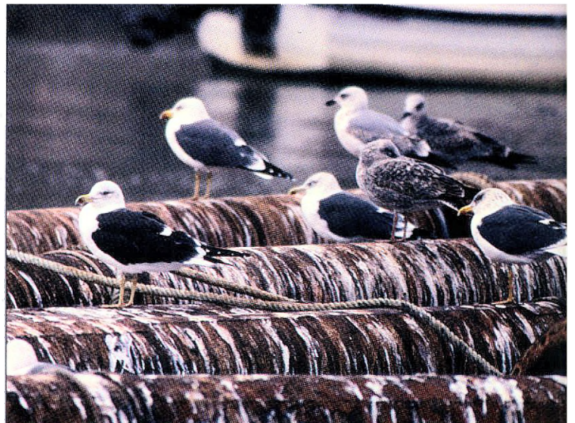
Figure 3. Adult L. f. intermedius (left) with L. f. graellsii and Yellow-legged Gulls (L. cachinnans; upper right) for comparison, photographed at Lagos, Portugal, 9 January 1994. Note the length of the wing extension beyond the tail (the fourth primary tip is in line with the tip of the tail). Compare the wing length and dark even color of the back and wings with that of the accompanying graellsii.