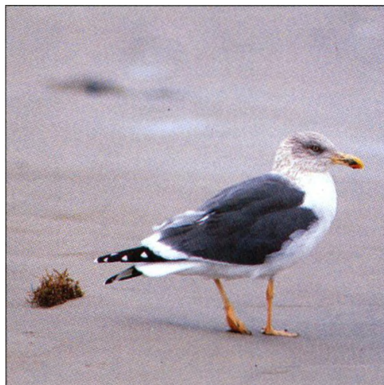
GREG W. LASLEY

Figure 11. A close-up of the intermedius shown in Figures 3 and 9, photographed 9 January 1994 at Lagos, Portugal. Compare this photograph with the birds pictured in Figures 7 and 15. All three are relatively dark birds, but this bird is not as gray; it is blacker. Also compare the size of the unworn white primary tips and the length of the wings in the three birds. In this bird, the wings are extremely long, and the end of the tail reaches the tip of the fourth primary. In the birds pictured in Figures 7 and 15 the unworn white primary tips are larger, and the tip of the tail reaches, or is near, the white tip of the third primary.