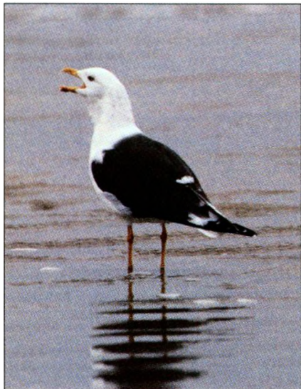
ANTHONY F. AMOS

Figure 5. Same adult L. f. fuscus as shown in Figure 2, here showing the relationship between feather wear and the brown color of the back and wings, which can be so pronounced in fuscus . Those feathers showing the most wear are brown, whereas those feathers on the mantle with the least amount of wear are grayer.