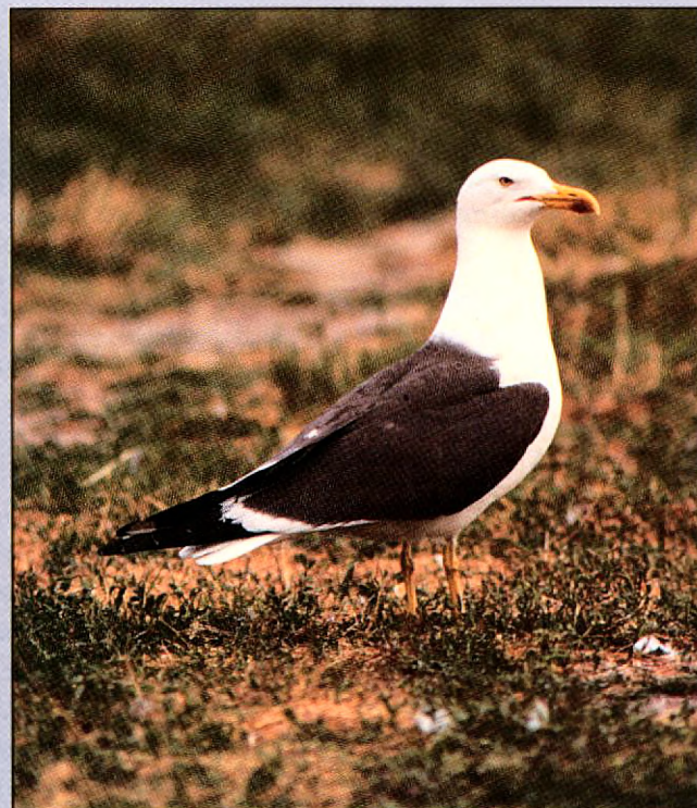
ROBERT H. LEWIS

Figure 3. A typical graellsii . The shade of gray, and the contrast with the black primaries, precludes this bird from ever being mistaken for any other subspecies of L. fuscus , despite the small size of the white primary tips caused by wear. Northumberland, England. June 1982.