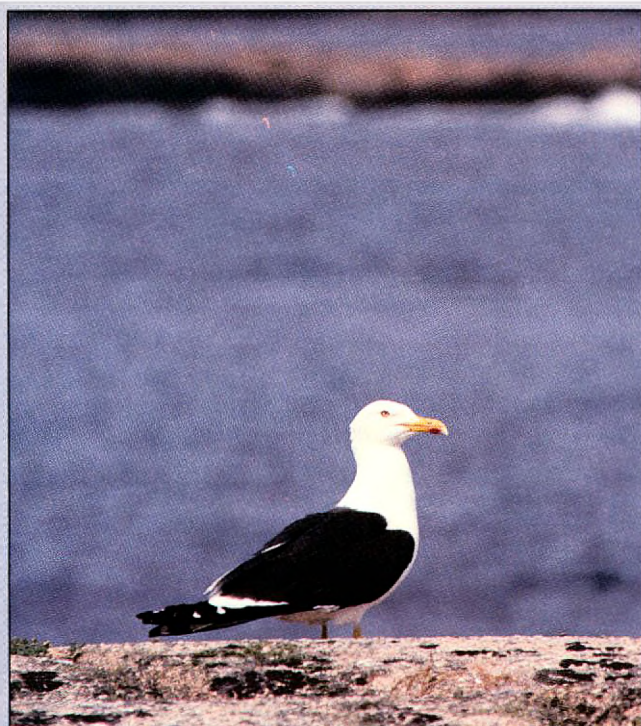
PETER W. POST

Figure 1. Breeding pair of L. f. fuscus in typical definitive alternate plumage. Note the even blackish color of the back and wings and the relative lack of contrast with the black primaries, the small white primary spots, the long wings with the tip of the tail opposite or falling short of the fourth primary tip, and the relatively long yellow legs. Horsvaer, northern Norway. June 1986.