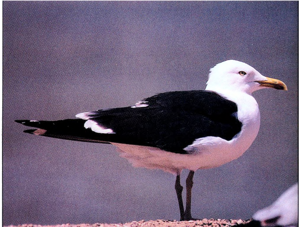
Figure 2. Typical example of L. f. fuscus taken on the wintering grounds at Eilat, Israel, Spring 1988. Note the even blackish color of the back and wings, small white primary tips, relatively long wings, and slender bill.