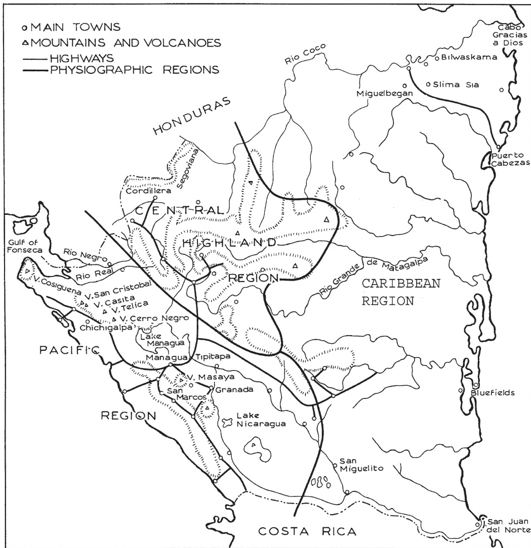
FIG. 2. Distribution of the major geographic regions in Nicaragua (based on Taylor 1963).

In editing the manuscript, we decided to maintain the style and flavor of the original rather than update its content or attempt to modernize its format—this decision was also in keeping with the wishes of Tom’s family. We added the Literature Cited section, corrected spelling, revised punctuation, and reinforced consistency in the style of reporting of dates and localities he had developed over many years of revisions. We took particular care in retaining the original details of specimen data, especially locality data, while also providing alternative modern names parenthetically. Standardizing locality names for Nicaragua was challenging, because Spanish, English (Caribbean), and indigenous names were often interchanged, and even spelling in official gazetteers was inconsistent. We followed Howell’s original taxonomic arrangement and use of nomenclature but added current scientific and associated English names after the species accounts (American Ornithologists’ Union 1998 and Supplements 42 to 50) when they diverged from those used by Howell. Finally, because we consider