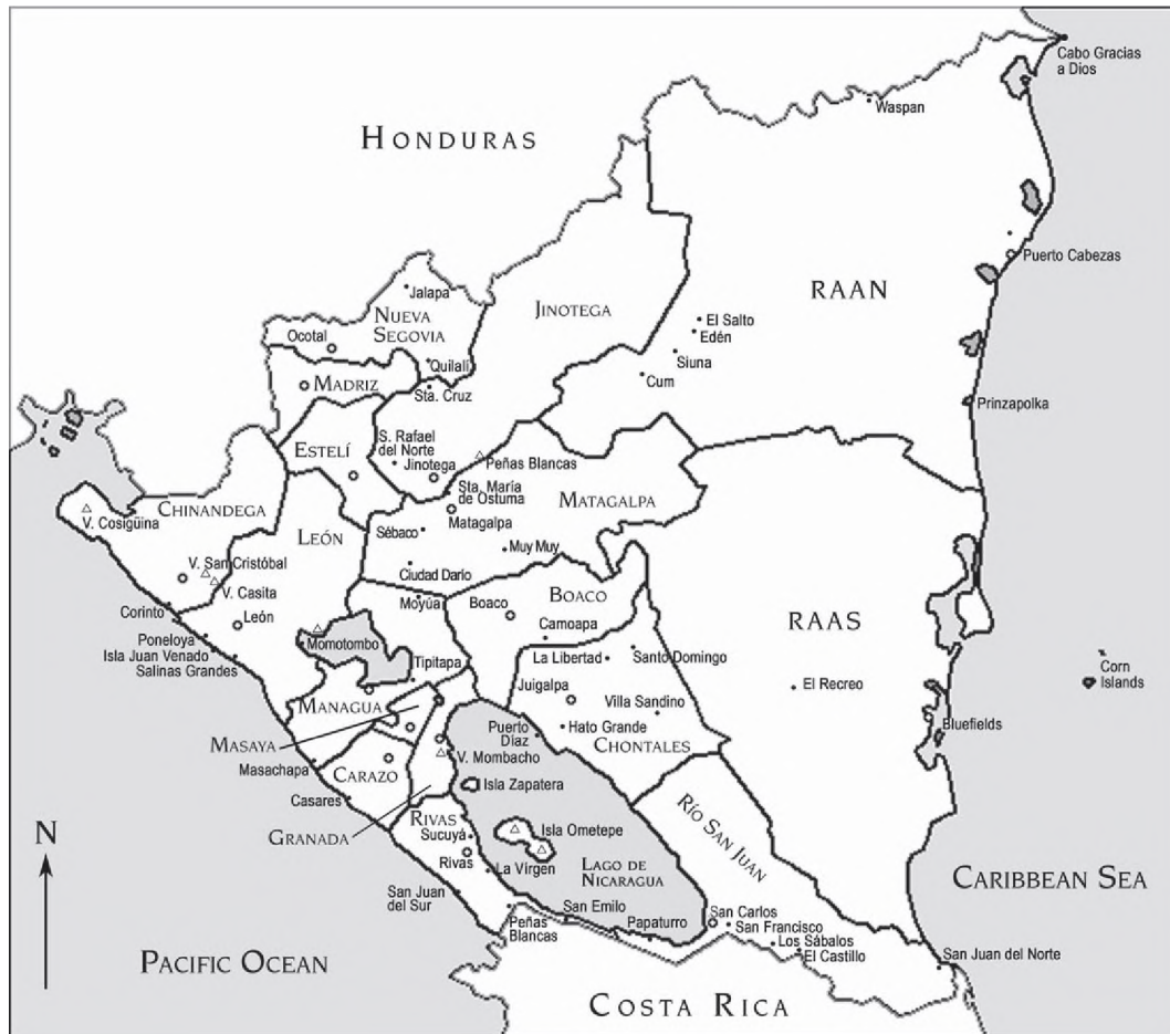
FIG. 1. Current political divisions (departamentos) and frequently referenced localities in Nicaragua.