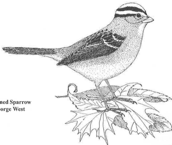
White-crowned Sparrow by George West