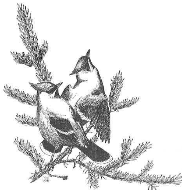
Bohemian Waxwings