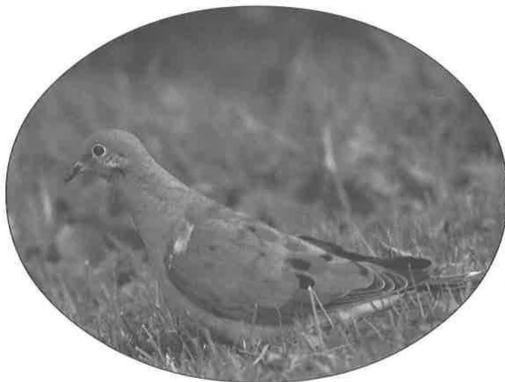
Mourning Dove