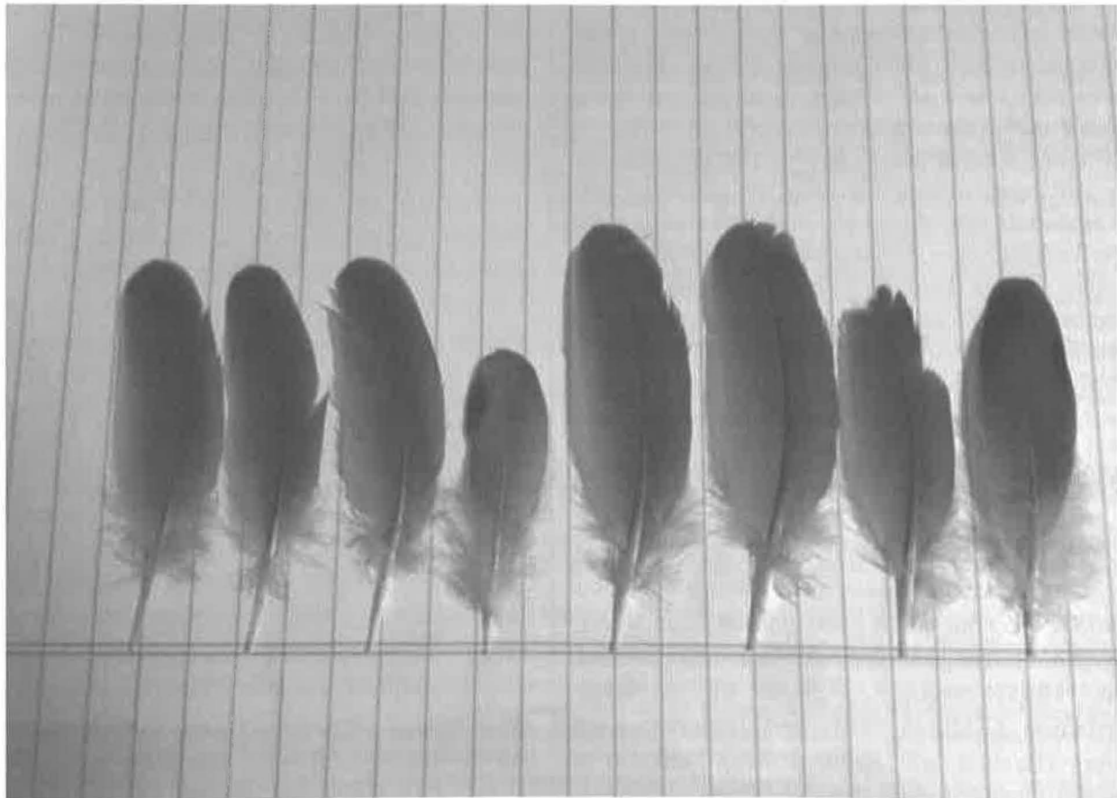
Fig. 1. Appearance of three secondary and one tertial feathers of juvenile (left) and adult (right) Mourning Doves. The four juvenal feathers on the left are shorter, fresher, and more rounded, while the four adult feathers on the right are longer, frequently worn, and more truncate. Note the black spot on the juvenal tertial (fourth feather from the left).

initially used to identify HY doves) and sex classification followed Reeves and Amend (1970) except for identification of SY doves in all years. Data collected were retention of white-tipped primary and secondary coverts, and molt of primaries (p) classified from none (no molting of primaries) to p10, and replacement of secondaries (s), 1 through 8 with s1 being adjacent to p1. Mourning Doves have four tertial feathers (modified innermost secondaries, Pyle 1997) numbered 1 through 4 with tertial 1 being adjacent to s8. Tertials can be mistaken for secondaries but differ in being more brown with at least one dark blotch extending into the vane of the feather (Fig. 1). The timing of secondary replacement in relation to primary molt of all captured birds was further examined in an independent sample in September through December 2013, when 25 unbanded doves were captured and banded each month ( n = 100 new bandings). The same data were recorded for recaptures ( n = 27 ) during this interval.