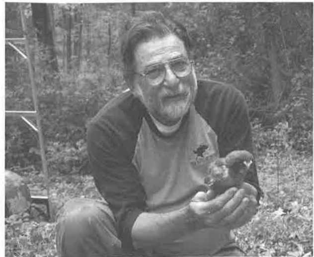
The author with nestling saw-whet owl.

Editor's note: The previous four photos can be viewed in high resolution color at: