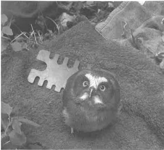
Nestling saw-whet owl with the author's leg gauge.