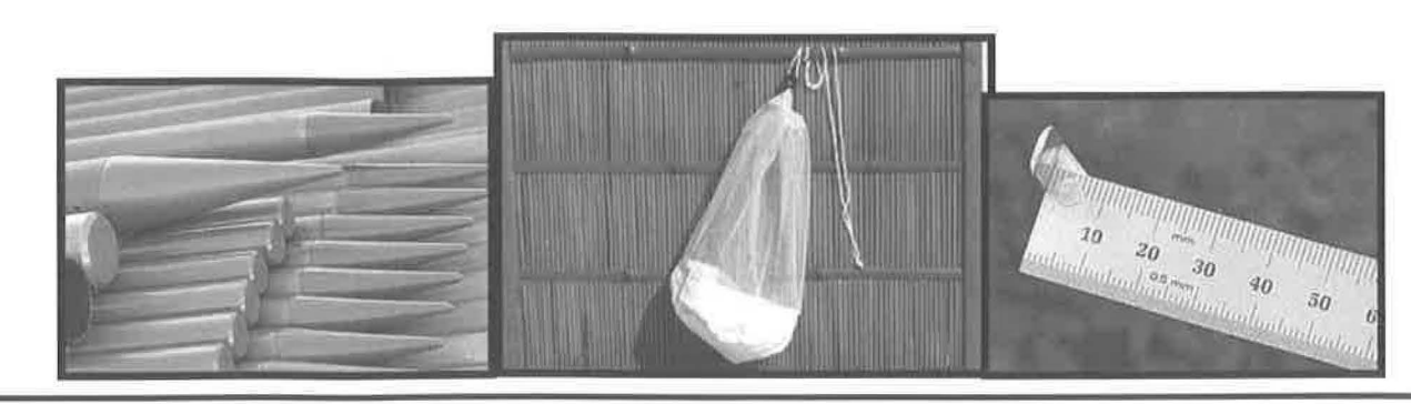
North American Bird Bander

AVINET, INC.PO Box 1103Dryden NY 13053-1103USAwww.avinet.comorders@avinet.comPhone from USA & Canada 888.284.6387Local & international phone +1 607.844.3277Fax +1 607.844.3915