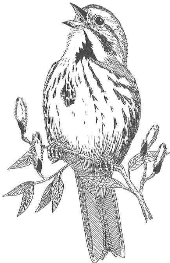
Song Sparrow