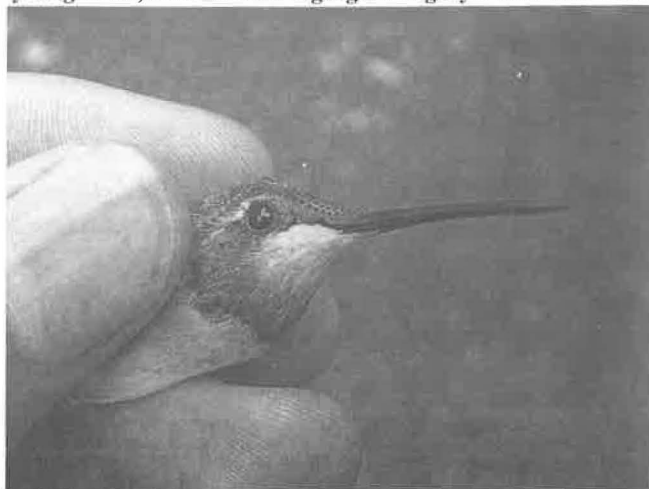
Fig. 1. All Ruby-throated Hummingbirds captured and banded at Hilton Pond Center for Piedmont Natural History, York, SC, also receive a bright green color mark on the upper breast. The mark is especially visible on females (below) and similar-looking young males, but the metallic gorget and gray flanks on an adult

Color-marking RTHU at Hilton Pond has the added benefit of making my banded hummingbirds more noticeable to observers away from the banding site. In fact, it was primarily because of green dye that observers reported RTHU from Hilton Pond at four distant locations described below.