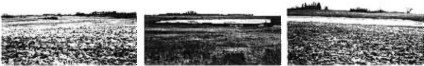
FIG. 1. (Upper) Mean maximum water depths of deep (▲), intermediate (●), and shallow (■) potholes used by grebes and coots from 1982–1984. (Lower) An illustration of wetland conditions from (left to right) 1982–1984 in a typical pothole. Note the flooded perimeter and ring of emergent vegetation in the wetland in 1983 (middle) compared with the other years.

In 1983, unlike 1982 and 1984, species segregated most along the spatial complexity dimension (Table 3). Again, the inclusion of the other microhabitat dimension (in this case, the depth gradient PC1) caused overall species' separation to decrease, although species still differed markedly in microhabitat use (Table 3). Also unlike 1982 and 1984, F. americana and P. auritus used sites very similar in vegetation height (PC1); but like 1982 and 1984, P. podiceps used patchier microhabitats than the other species. Like 1982 and 1984, niche separation was greatest for F. americana - P. auritus and less for the others (Fig. 2).