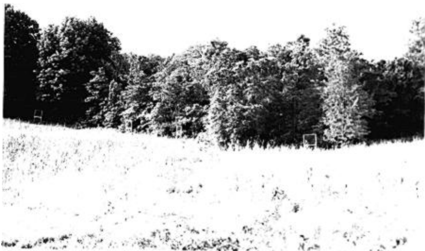
FIG. 1. Field experiment study site in Cobden, Union County, Illinois.

species that occur in the two countries (A.O.U. 1983). Table 1 lists the 20 most frequently reported species in the survey. In general, the diversity of collision victims include species that occupy every major habitat type. Absent from the list are birds that rarely occur in habitats containing man-made structures. They include most waterbirds, soaring hawks, and terrestrial species occupying unpopulated or sparsely populated desert, grassland, and forest. Species accounting for most strikes at single residences were similar to those in the survey. Exceptions were relatively large numbers of Yellow-billed Cuckoo collisions at the Hayward house and Blue Jay ( Cyanocitta cristata ) and House Sparrow ( Passer domesticus ) strikes at the Rothstein house.