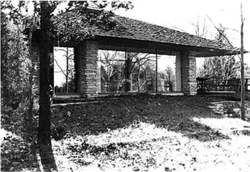
FIG. 4. Clear glass of Hayward house showing reflective effect.

49 (80.3%) strikes (Table 3). These data indicate that collisions occur at windows of different sizes and heights from the ground. Collisions may be more frequent at large windows ( >2 \text{ m}^2 [21.6 \text{ft}^2 ]) placed at ground level and above 3 m (10 ft). Window orientation was known for 49 (80.3%) strikes. Strikes per square meter of glass for each facing direction were: 0.5 northeast, 0.1 southeast, 0.9 south, 0.4 southeast, and 0.7 west and northwest. During fall and spring, windows that cut across and faced migratory flightpath directions, north and south respectively, were suspected of posing a greater hazard to migrants than windows facing east or west. To test this hypothesis, only migrants in southern Illinois were considered and consisted of 14 fall and three spring migrants at the Hayward house in 1975 and 1976. As might be expected for fall migrants, eight (57.1%) struck windows oriented northwest, but five (35.7%) hit southwest, and one (7.1%) struck a west facing window (Binomial test, P = 0.79 ). Only one (33.3%) spring migrant hit a window oriented southwest while two (66.7%) others struck windows facing northwest. Comparison of strikes per square meter of glass showed no marked tendency for south or north bound migrants hitting north or south facing windows, respectively. These data indicate that windows facing general migratory directions of north and south are no more hazardous than windows oriented in other directions.