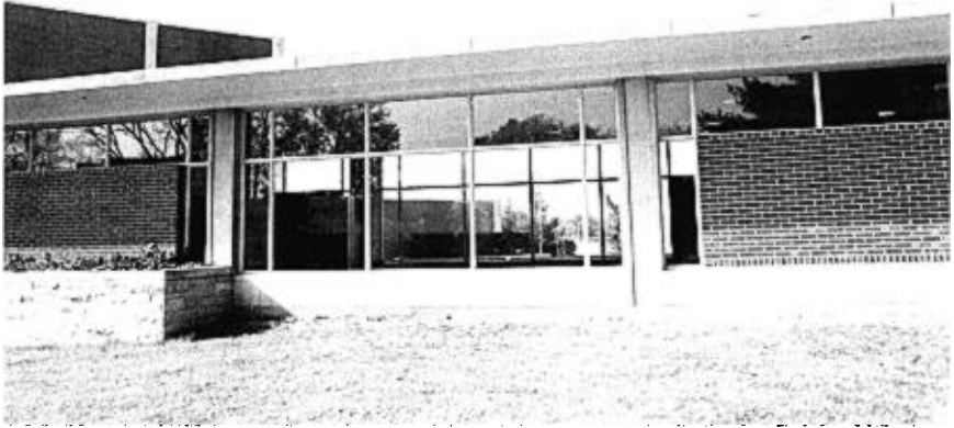
FIG. 3. Clear glass windows of a corridor showing see-through effect.

Windows and man-made structures. —Bird strikes occurred at windows with clear transparent panes and at those with tinted reflective panes. When clear windows are installed one behind the other, such as in corridors, stairways, or rooms, they create an illusion of an unobstructed passageway (Fig. 3). Tinted windows create an illusion of unobstructed habitat which is mirrored on the glass surface. Clear panes mimic tinted mirror-like panes when little or no light is visible behind them (Fig. 4). Except for a seemingly related incident of frightened individuals hitting the side of a home, I found or collected no records of strikes at opaque, translucent, or stained glass windows which present other visual effects. At one site, over a 5-year period (1975–79), one account documented a strike at a reflective glass door but none at the adjacent stained glass windows of a church in Madison, Illinois (V. Lecko pers. comm.).