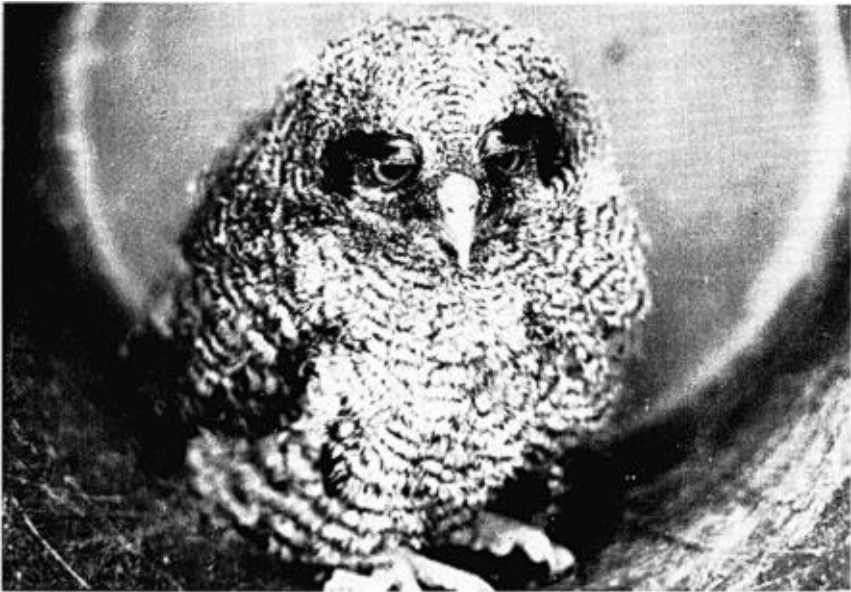
FIG. 2. Tropical Screech Owl nestling on the 26th day showing black feathers on eyelids.

from where it watched the nest. On subsequent nest examinations, in addition to ruffling out its plumage and erecting its "ear tufts" the adult owl snapped its bill, swayed back and forth sideways, and raised and lowered its body by flexing its legs. During the first examination after the nestlings had hatched, the brooding owl threw itself flat on its back over the nestlings and raised its legs with claws extended toward me. Gradually, however, the attending adult owl appeared to become accustomed to the daily visits and soon I was able to easily remove and replace the nestlings from under it without causing more than a token feather ruffling.