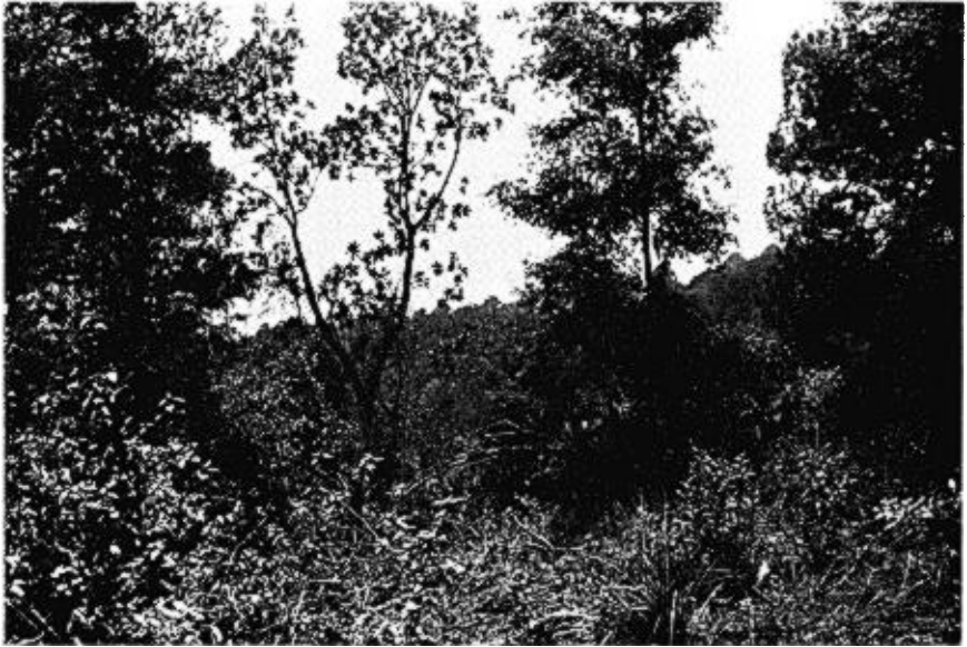
FIG. 1. Disturbed pine-oak forest S of Tres Cumbres, Morelos (2880 m), in a Chestnut-sided Shrike-vireo territory.

resulting in a mosaic of small fields and patches of forest (Fig. 1). We worked in both localities for parts of 3 days in November 1971 and 6 days in November 1972 and 16 days each in May 1972 and 1973.