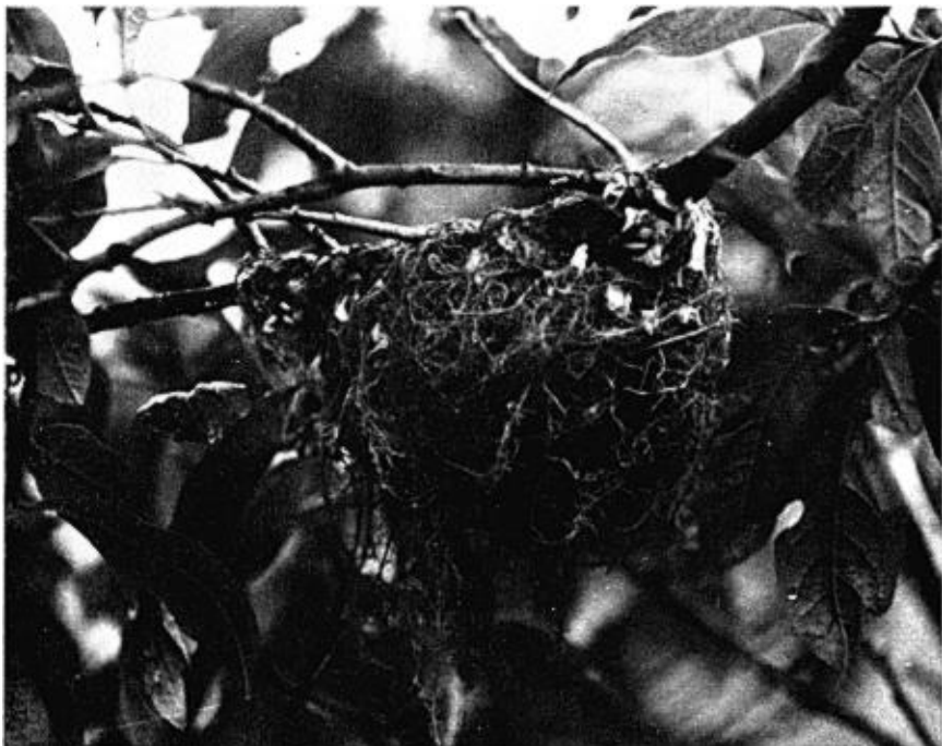
FIG. 3. Nest 1—first known nest of Vireolanus melitophrys in a sweetleaf ( Symlocos sp.).

Externally Nest 1 (Fig. 3) measured 100 mm in maximum diameter, 80 mm in minimum diameter, and was 66 mm deep from rim to bottom. Internally the nest measured 70 mm in maximum diameter, 60 mm in minimum diameter, and 50 mm deep. The branches of the fork from which the nest was suspended were 6 and 8 mm in diameter and the fork subtended an angle of 45°. The nest was lined with fine grasses, pine needles, and fibrous plant parts. The bag was largely constructed of filamentous lichen, woven together with spider webbing, and adorned on the exterior with spider egg cases. Except for being larger, the nest closely resembled nests of the 14 species of vireos with which we are familiar. Nest 1 was completed between 8 and 18 May. Judging from our experience with building rates in vireos and extrapolating accordingly, about 20 days were required for total construction. Progress at Nest 2 was slower and as much as 25 days may have been required for its completion. Certainly so large a nest as that built by the Chestnut-sided Shrike-vireo could not be finished very rapidly at the rate of no more than 5 or 6 building