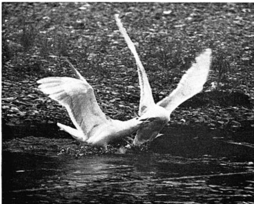
FIG. 2. A fight over a salmon carcass, gull on right trying to flee. Such fights usually last only a few seconds.

Long Calls that occurred under stress are discussed under encounters with juveniles and under gull-bear relationships.