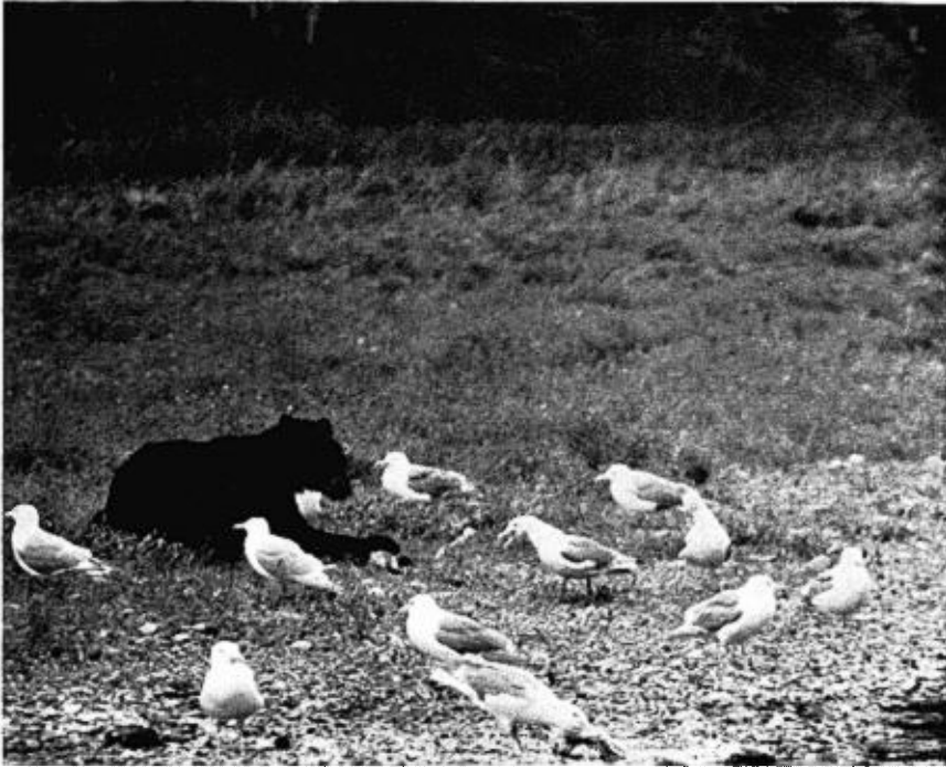
FIG. 4. Gull waiting for black bear to finish feeding on female pink salmon. Note Long-Calling gull at center.

bergen, 1960). There is, however, no direct evidence for this in the Glaucous-winged Gull.