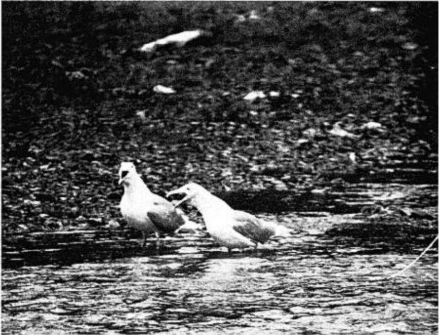
FIG. 1. Typical Oblique-cum-Long-Call Display, gull on left defending.

ing fish. The stimulus for the attack was the presence of another gull feeding nearby. Gulls not feeding were seldom disturbed, as long as they were behaving in a nonaggressive manner.