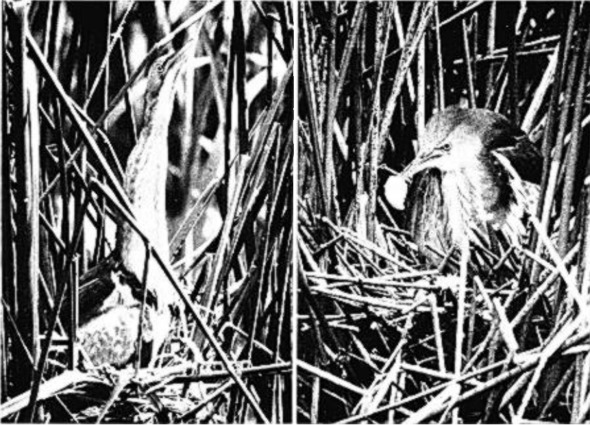
FIG. 8. (Left) Freezing behavior at the approach of a Great Blue Heron. FIG. 9. (Right) Female removing egg shell from the nest.

Two observations were made during the present study which suggest behavior toward large predators. In one, a female suddenly rose from the normal incubation posture to the "freeze" (Fig. 8), and a Great Blue Heron ( Ardea herodias ) flapped over. The same female and another were observed watching buteos which were soaring at such heights that they could not be identified by the observer. That buteos may prey on bitterns was assumed when a young Red-tailed Hawk ( Buteo jamaicensis ) was found standing in water on a weak but live adult female bittern.