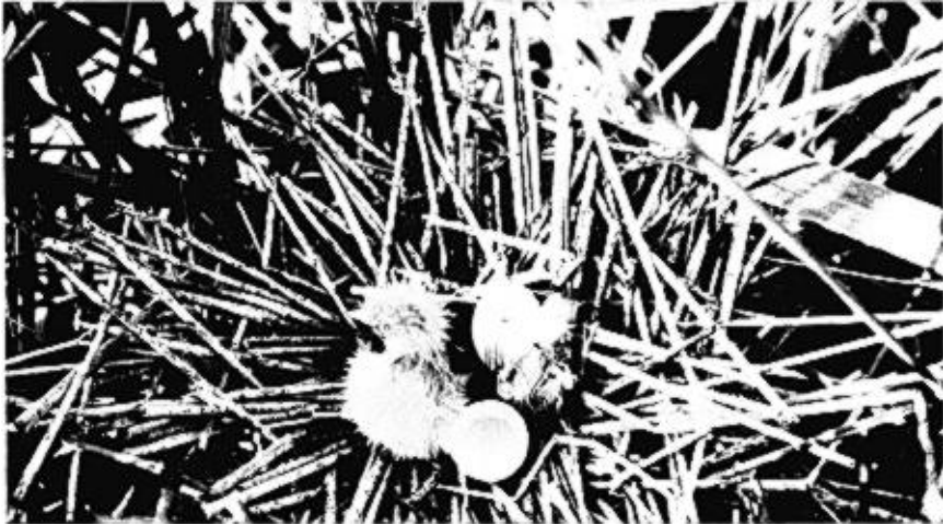
FIG. 1. Nest in hardstem bulrush at Goose Lake, Iowa, showing criss-cross pattern of nest material.

sticks, but they had been gathered from within a few feet of the nest and placed in some isolated stalks of cat-tail.