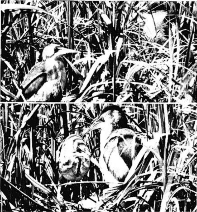
FIG. 6a. (Top) Male approaching nest with crown and body feathers erected. Female has crown depressed.