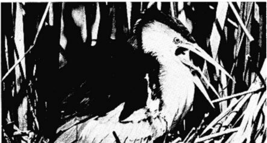
FIG. 4. Gagging.

Gaping is common, especially following a period of alertness to food or intruders. A similar movement (Fig. 4) involves tongue stretching. Meyerriecks ( in litt. ) terms this “gagging” in the Green Heron ( Butorides virescens ). The