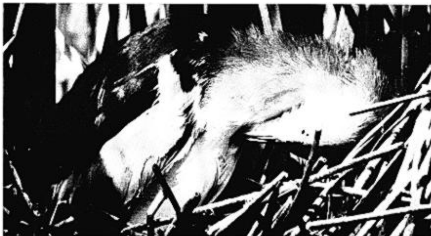
FIG. 5. Preening.

bill is opened rapidly and more widely than in the throat posture. In one case, the gape was combined with a neck-stretch and wagging of the head and eventually the bird left the nest to drink, defecated, and returned to incubate. Another apparent fatigue-relaxing movement is the bill-stretch; the tips of the mandibles are held together but the mouth is opened proximally.