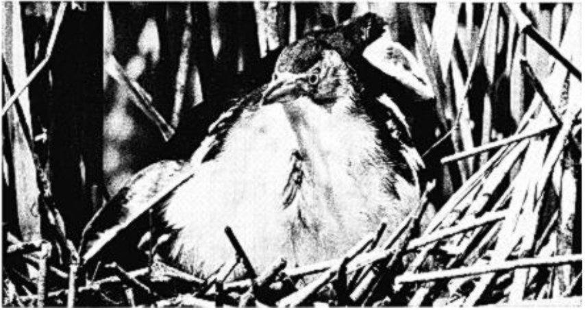
FIG. 3. Use of the wings in changing position on the nest.

Comfort Movements. —During long hours of incubation, turning is the most frequent movement. This is invariably accomplished with alternate opening and pushing with or refolding of the wings (Fig. 3). A quick rise and complete fluffing of feathers and shaking of the body is another common comfort movement. This may or may not be accompanied by preening, turning, poking, and settling. Partial shakes of either body or head also occur.