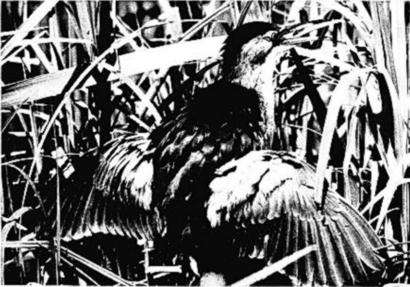
FIG. 10. Shading of young and panting and sunning by the male.

Innate Responses of the Young. —When just free from the shell and still wet, the young bittern is equipped with those reflexes vital to its survival. The gripping response of the feet is weak but apparent whenever the bird is moved or its feet are removed from a solid surface. If turned on its back or side, it attempts to right itself by swinging its feet and grasping. When held on an inclined plane, the feet push forward and prevent the bird from slipping. The bird is nearly able to hold itself on a branch when newly hatched and birds one day old or more certainly can keep from falling from the nest by this means. At several days of age, the bird can firmly grip twigs and remain in that posture for some time (see Nero, 1950). When gripping a piece of vegetation, the bird uses its wings and curved neck as well as its feet and counterbalances the body with the head.