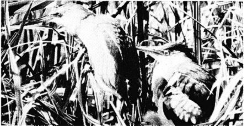
FIG. 6c. Male's crest erected as female departs. Note her depressed crown feathers.

displayed? In two of the three trials on two different nests, males returned. Oncoming birds of both sexes approached cautiously, with typical erect crest and body feathers, and came on the nest despite the presence of the dummy. In all cases, they approached from behind the bird, hissed, and pecked it at the back of the head. To prevent desertion of the nest and damage to the skin, the incubating bird then was flushed from the nest.