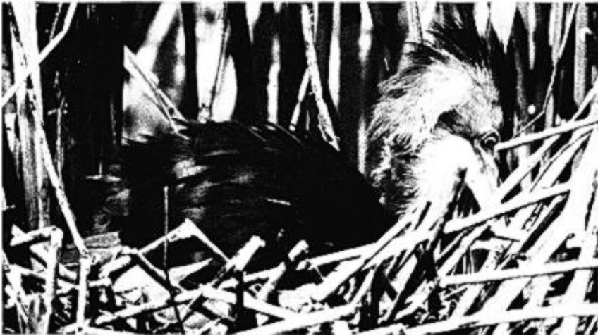
FIG. 7. Male watching food below nest.