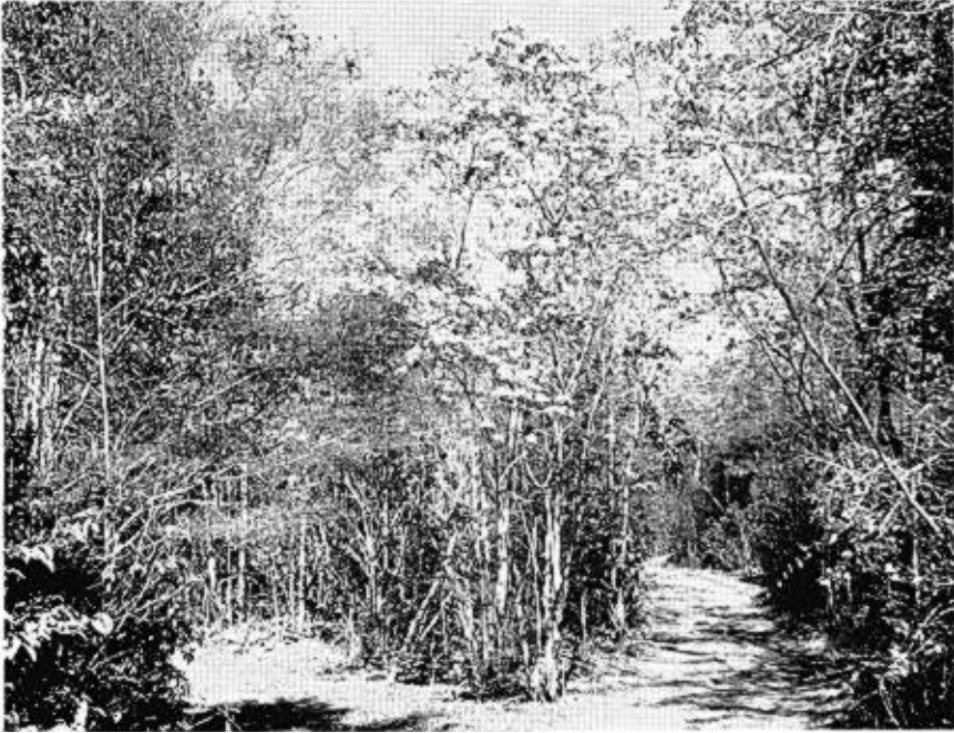
FIG. 4. View of the interior of the forest. The road was built by loggers who removed all the large trees, but this part of the forest has not been invaded as yet by charcoal burners and the undergrowth is undisturbed.

fore, when a male appeared at a smaller bush somewhat separated from those fought over by the Emeralds. It fed quietly for some seconds and was joined by a female of its species, and then by a male Emerald. The two species showed no signs of being aware of each other, moving about on the same bush about a foot or two apart. The contrast in the mutual behavior between the two species and the squabbling among the Emeralds a few feet away was very great. As Zayas wanted to take some pictures, the male helenae was captured easily in a sweep of the butterfly net and released a few minutes later unharmed. While held, it remained silent and at no time offered the slightest struggle. Its anxiety, if any, was expressed by one or two movements of the head and a few blinks. Zayas tells me that on several trips to the Cape he has seen but one male on each trip, always in the same vicinity. The Cubans that we talked to show much interest in this bird not only because they know that it is very beautiful but also because they have been told that the male is the smallest of all birds. Yet almost no one that we talked to had seen it. In the one that I held, the body, not counting the tail and bill, was barely over an inch long and the toes about the thickness of an insect pin of very small gauge.