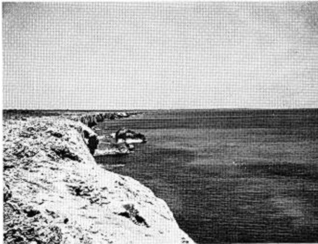
FIG. 1. Cliffs along the southern coast of the Peninsula de Guanahacabibes.

disappearing, and a large saw mill has been erected. Worst of all, it is beginning to be invaded by charcoal burners who use the smaller remaining hardwood species. Figures 3 and 4 show the depredations already suffered. This type of forest grows very slowly and, once it is destroyed, it is not likely to be replaced. When it is gone the Peninsula will be transformed into a wilderness of scrub and rock, as it has little soil and cannot be used for agriculture or grazing. The Peninsula, or at least its southern half, could