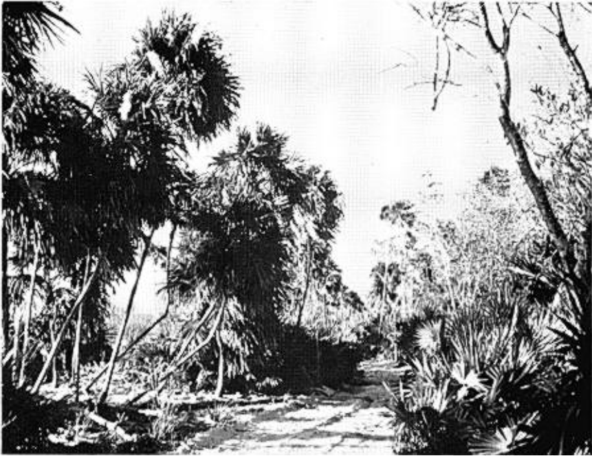
FIG. 3. View near the edge of the forest where it borders the savanna. To the left of the road, beyond the screen of palms, all trees have been removed, the larger ones for timber, and the small ones and undergrowth for charcoal.

[ Crotophaga ani . Smooth-billed Ani; Judío].—This Ani is a common bird in Cuba, where it inhabits savannas or open cultivated country with a few trees, and therefore was not present at the Cape. Its life history in Cuba has been studied by Davis (1940) at the Atkins Garden and Research Laboratory at Soledad near Cienfuegos in Las Villas. The feeding habits of the closely related Groove-billed Ani ( Crotophaga sulcirostris ) of Central America were studied by Rand (1953). Both species feed chiefly on moving animals, mostly insects, but, according to Davis, the Cuban one changes its food habits with the season. During the dry season it subsists largely on vegetable matter, whereas in sulcirostris no such change is noticeable, according to Rand, and vegetable matter seems to be eaten sparingly. Both species follow cattle and, according to Davis, the Cuban bird learns readily to follow closely the footsteps of a man, or even a gasoline-powered mowing machine, to glean the insects disturbed. In view of the fact that the anis and Mrs. Vaurie and I are fellow insect collectors, I tried to see how successful they were but, strangely enough, I never saw them catch an insect.