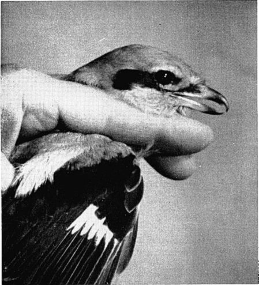
FIG. 4. Gray Shrike (? female), Arcadia Township, Lapeer County, Michigan, December 17, 1953. Note the interrupted mask and the extent of the light area on the lower mandible.

to the ground. Fluttering its wings like a young bird about to be fed, the shrike slowly moved sideways down the cable until within a few feet of the ground, uttering high p'seet notes which I could barely distinguish from those