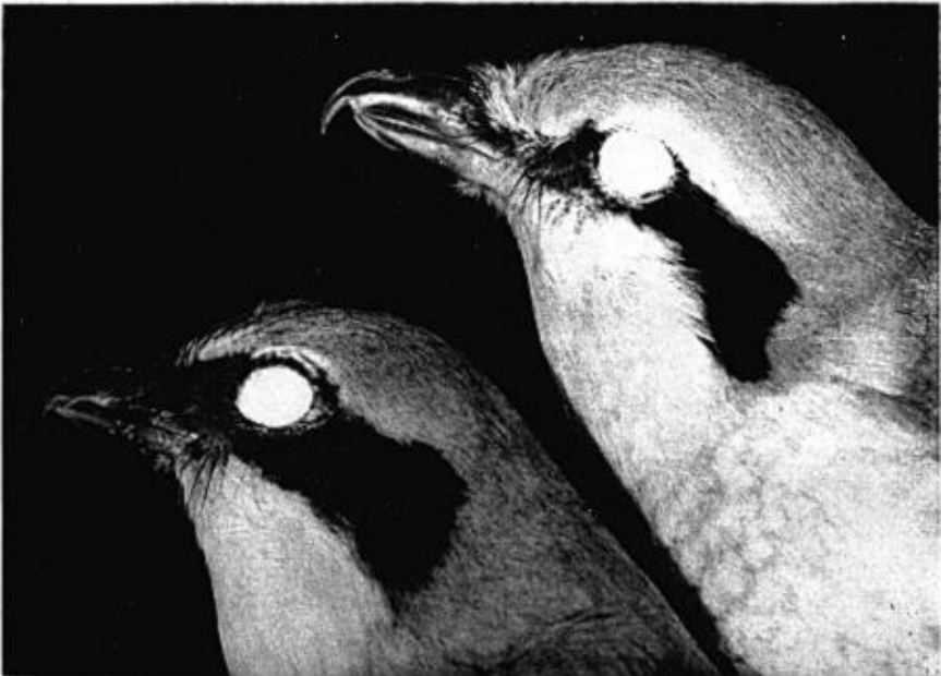
FIG. 3. Adult male Gray (right) and Loggerhead Shrikes (specimens 4 and 5 of Fig. 2), showing differences in width of mask and size of bill. (The bill color is considerably darker than that in living birds.)

Several observers have noted that the Gray Shrike's flight often seems more slow and deliberate than that of the Loggerhead. This difference may be more apparent than real, however, for Bent (1950:120) called the Gray