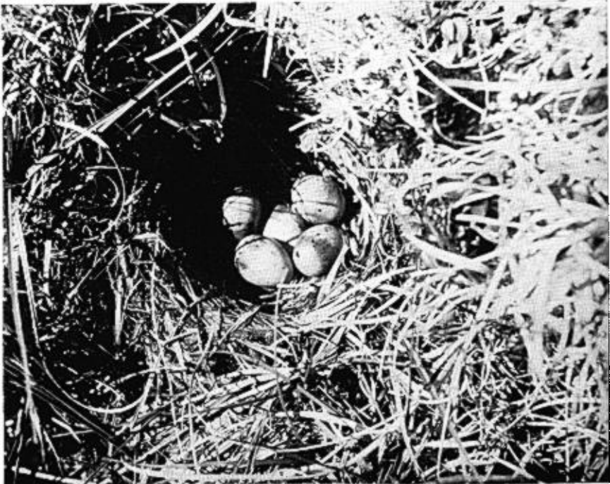
FIG. 3. Lapland Longspur Nest 20, showing pale eggs and lining wholly of grass (without feathers or hair). Photographed July 8, 1953.

From Table I these facts are apparent: (1) Of a total of 97 eggs laid in 22 nests, 22 did not hatch, but only one of the 22 nests was utterly destroyed, contents and all, by a predator. (2) Of 75 chicks known or believed by us to have hatched, 62 apparently left the nest successfully. (3) In each of five nests, a single chick disappeared prematurely. If predation were responsible