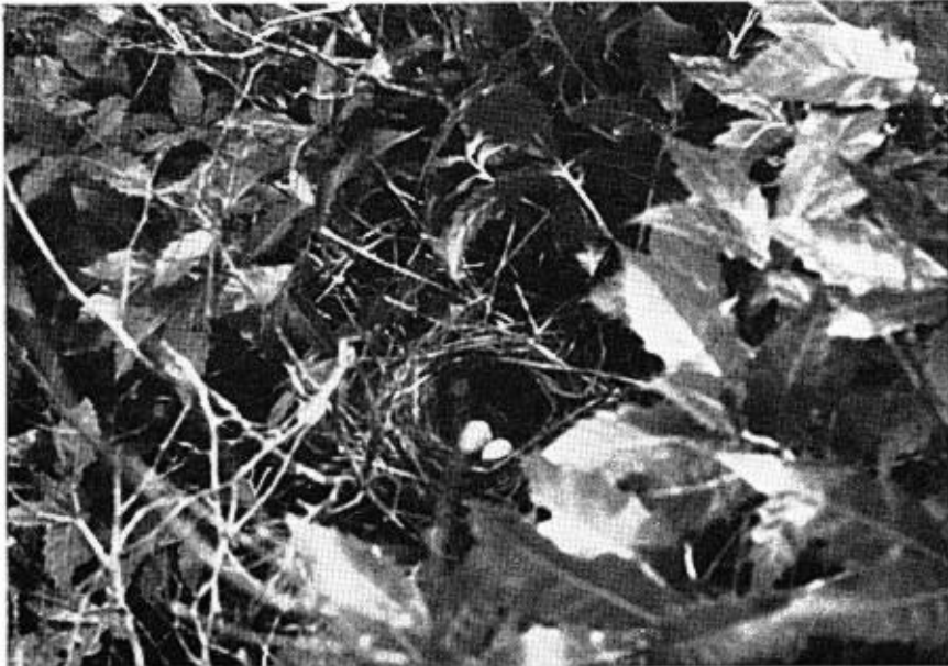
Nest of Orange-billed Nightingale-Thrush ( Calharus aurantiirostris ) three feet above ground in scrub oak at about 6000 feet elevation above the village of La Joya de Salas, Tamaulipas, México. Photographed May 28, 1949, by William B. Heed.

So far as we know C. aurantiirostris has not before been recorded in Tamaulipas. Our three specimens (May 27-28), all males, have the pale gray under parts and not very rufescent upper parts of clarus .