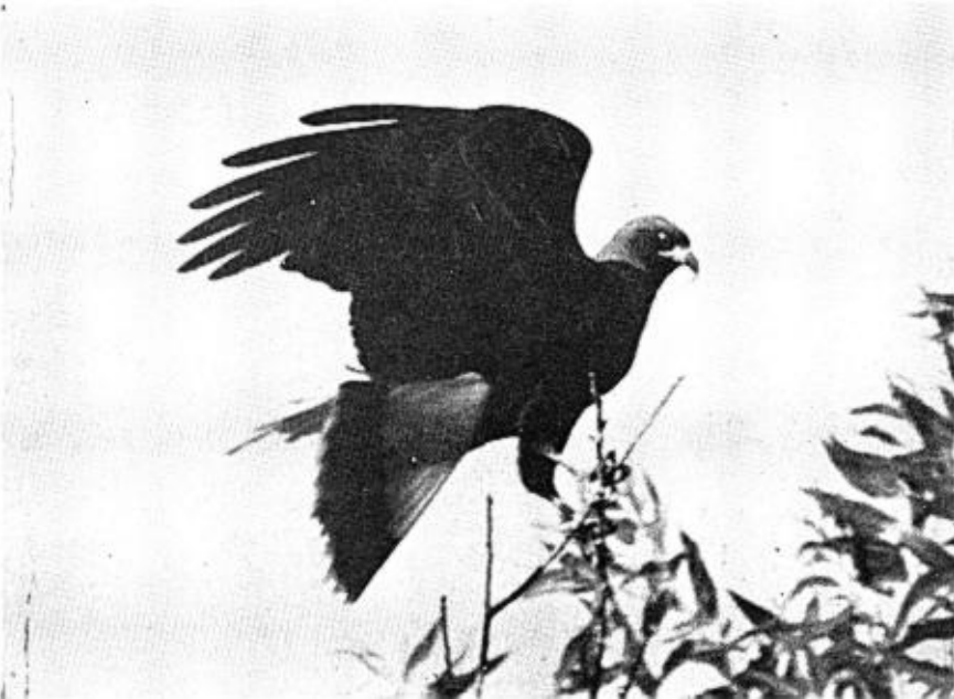
Male Northern Everglade Kite alighting in willow near nest. Photographed at Lake Okeechobee, Florida, May 15, 1941, by Hugo H. Schroder. That day Mr. Schroder saw 27 adult kites in the air at one time and found ten nests, each with eggs or small young.

The ancient, one-eyed boatman who has watched over the kites for so many years piloted us into the marsh. Snails ( Pomacea paludosa ) were abundant: we picked clusters of their pink eggs off the reeds. For about an hour we watched the kites as they coursed back and forth hunting snails. They carried the snails in their red feet. Usually they took their prey back toward the nesting area, but occasionally we saw a female perch on a fallen post and eat a snail. We must have seen certain birds several times. Our estimate of 12 kites probably was conservative.