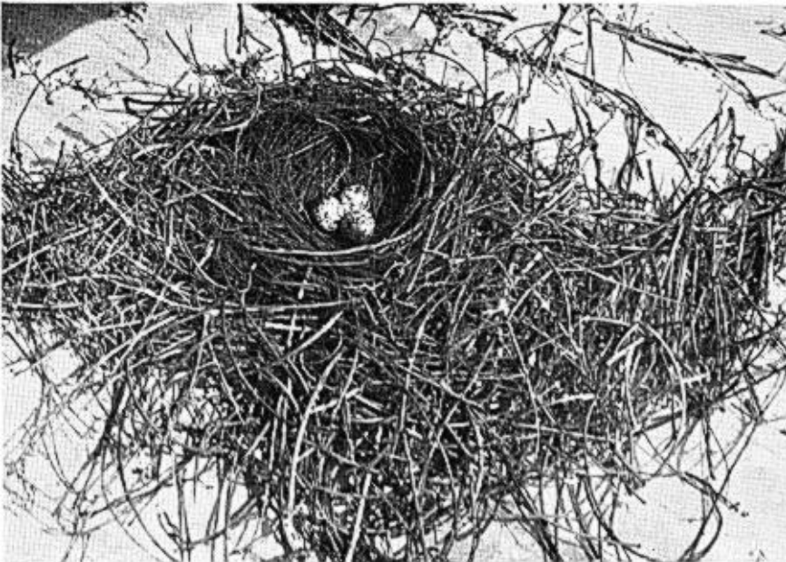
Nest and eggs of Streaked Flycatcher. Photographed on Barro Colorado Island, Panama Canal Zone, in July, 1949.

On July 11 the female was on the nest (so far as I know) continuously until 10:30 a.m., at which time she left the nest with the male and went off to feed. The day was warm. The birds did not return until 1 p.m. The female went to the nest almost immediately and settled down to incubating. The male remained in his favorite orange tree, perching near the top and preening vigorously. At 4 o'clock the female left the nest, returning presently with several