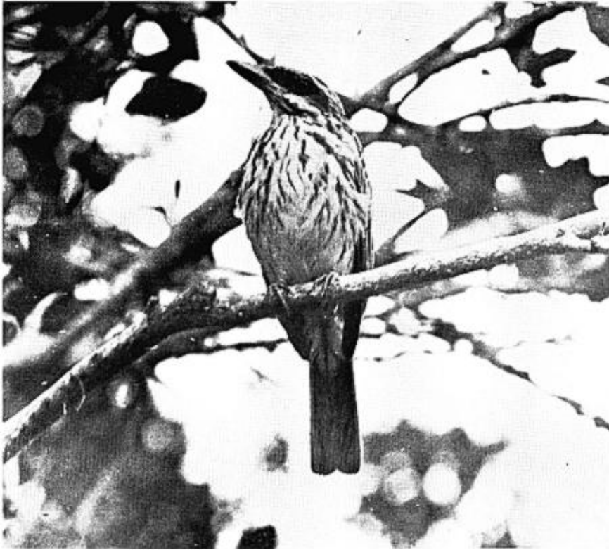
Streaked Flycatcher ( Myiodynastes maculatus ) on favorite perch near nest. Photographed on Barro Colorado Island, Panama Canal Zone, in July, 1949, by Alfred O. Gross.

and turning, sometimes going about in a complete circle, she forced them into place. Then, with wings folded and tail stuck upward so that it touched the overhanging roof, she rested, panting hard. The heat must have been intense, for at that hour the roof was not shaded in the slightest. Five times that morning I observed this pressing into the lining of a load of fibers. The procedure was essentially the same each time. About noon nest-building stopped for the day.