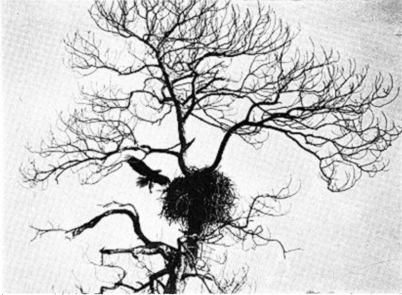
Bald Eagle bringing food to the nest. Gibsonton, Florida. February 7, 1946.