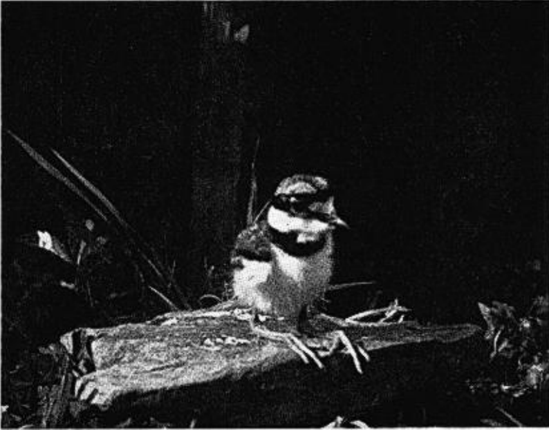
Figure 4. A characteristic resting posture of young Killdeers.

will call killdee softly as if in answer. After a few seconds the calls are repeated. At intervals the parents give the pup pup call used as the brood call.