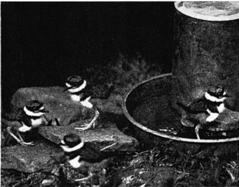
Figure 1. Young Killdeers within the enclosing fence the day after hatching.

Brooding, guarding against enemies, and warning of danger appear to be the extent of the parents' responsibilities. These duties are performed with a high degree of success. Of five broods I confined within uncovered enclosures, with no protection against hawks or other predators, only one brood came to grief. The indications were that these young had been eaten by a cat.