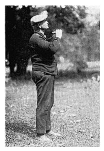
1926—Aged 61 Still birding