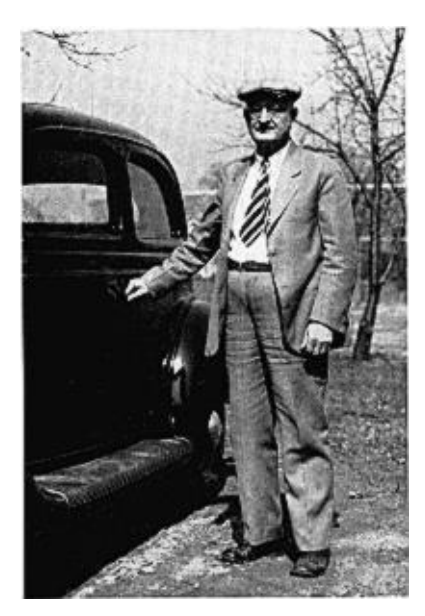
1936—Aged 71 His 54th Ford car