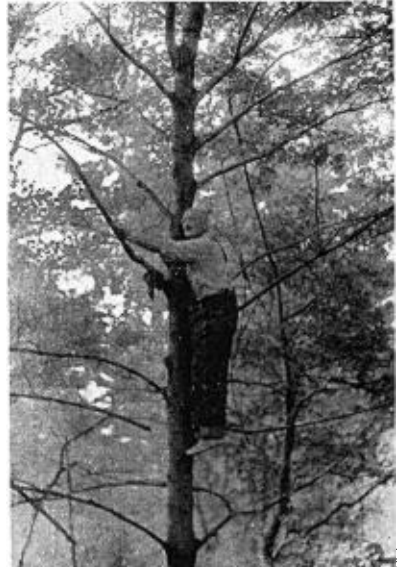
1933—Aged 68 Trimming trees