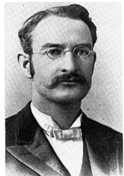
1892—Aged 27 A Graduate of Oberlin