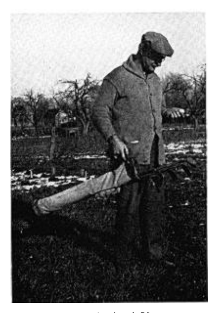
1915—Aged 50 A Golf Enthusiast