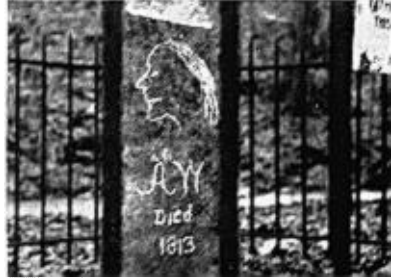
FIG. 6. Detail of carving on the face of the monument.