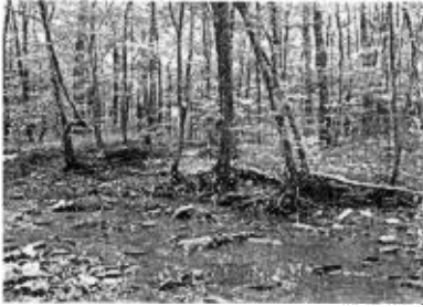
FIG. 5. Location of the Alexander Wilson monument in Indiana.