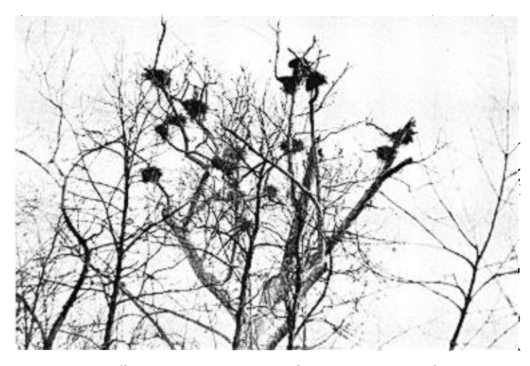
FIG. 1. The Waggoner Heronry. Seventeen nests in this tree.