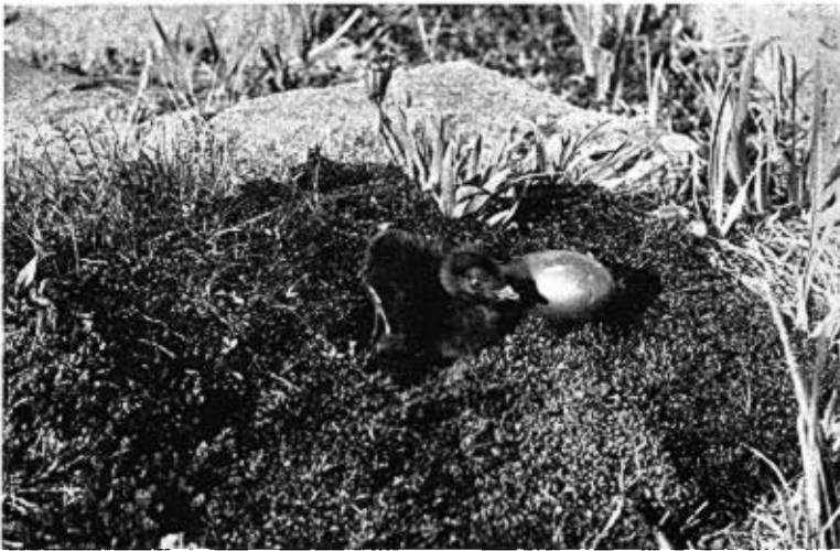
FIG. 11. Nest of Red-throated Loon, with newly hatched young and egg.