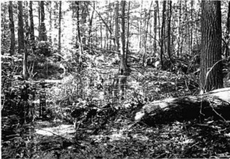
FIG. 12. A second growth swamp forest in southern Wayne Township, typical of numerous similar areas throughout the county, where a large portion of the forest floor is covered with shallow pools of water throughout the summer months. The constant water supply, low temperature, and high humidities have preserved in abundance many rare northern species.