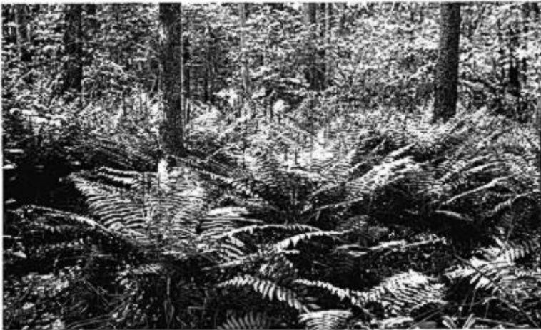
FIG. 13. Luxuriant growth of cinnamon fern in the Pymatuning Bog among tamarack, cranberry tree, and hobblebush. The ground cover is of gold-thread, Clinton's Lily, twin flower, and Dalibarda. Four species of club mosses are common. Sixteen species of warblers nest here.