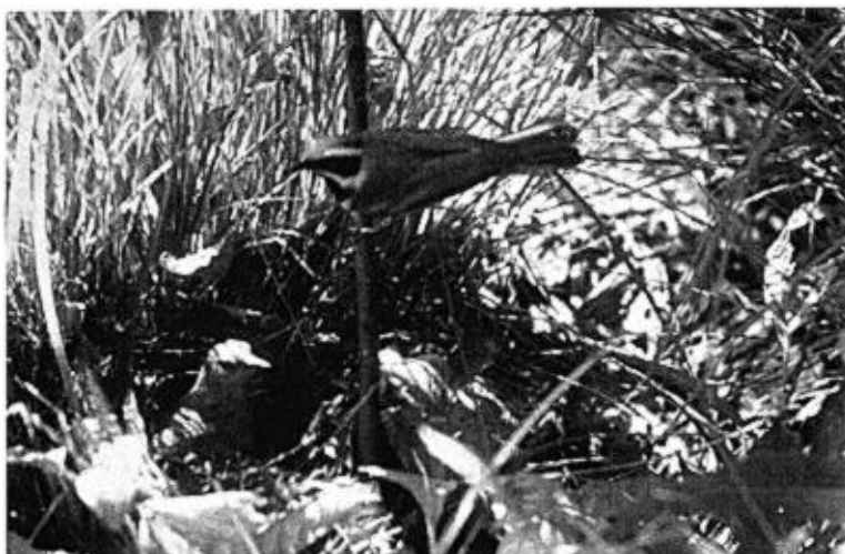
FIG. 16. A male Golden-winged Warbler bringing food to five newly hatched hybrid young which are being brooded over by the female Blue-winged Warbler. Enlarged from a movie film taken by Roscoe W. Franks and the author in southern Wayne Township on May 30, 1930.

NORTHERN PARULA WARBLER. Compsothlypis americana pusilla . (1). Very rare. Observed along both the Grand and Ashtabula River gorges in summer but nesting appeared doubtful. A pair was present