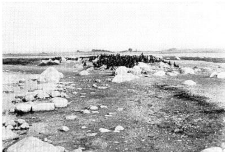
FIG. 56. The Double-crested Cormorant colony on the island in Waubay Lake, S. D.