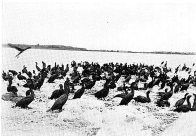
FIG. 57. Closer view of the birds.