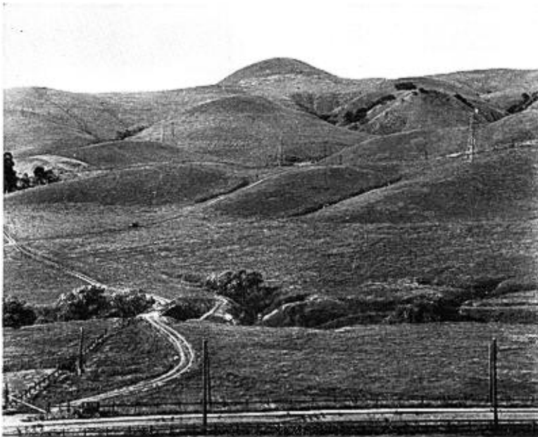
FIG. 14. View looking north across the territories occupied by two pairs of Icterus bullocki near Pinole, Contra Costa County, California. Photographed April 30, 1930.

On April 16 female orioles were noted but it is believed that they were present several days earlier. Notable actions of the females were not observed until the morning of April 25 when both males A