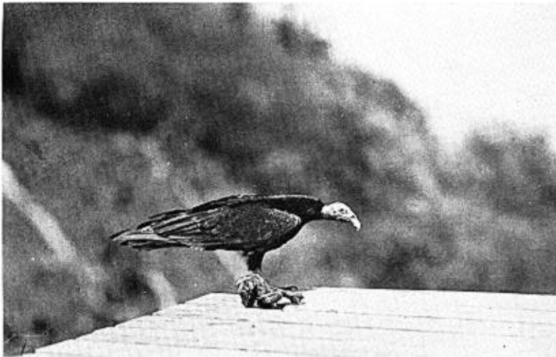
FIGURE 7. A Turkey Buzzard photographed from the porch of the laboratory. (Photo by J. Van Tyne, March, 1927).