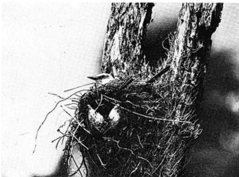
FIGURE 4. The Kingbird ( Tyrannus melancholicus chloronotus ) which nesis abundantly in March on Barro Colorado. (Photo by Walter E. Hastings).