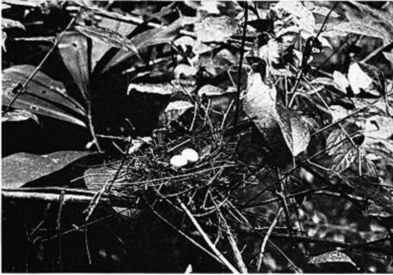
FIGURE 6. The nest of the Cassin Dove ( Leptotila cassini) may be found both in the wet and the dry seasons. Photo, Barro Colorado, March 19, 1927