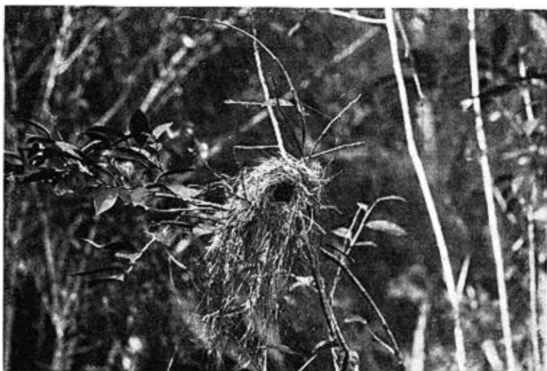
FIGURE 5. The nest of a small Flycatcher ( Myiozetetes similis columbianus ) on Barro Colorado. Many birds in Panama build covered nests. (Photo March 17, 1926, by J. Van Tyne).