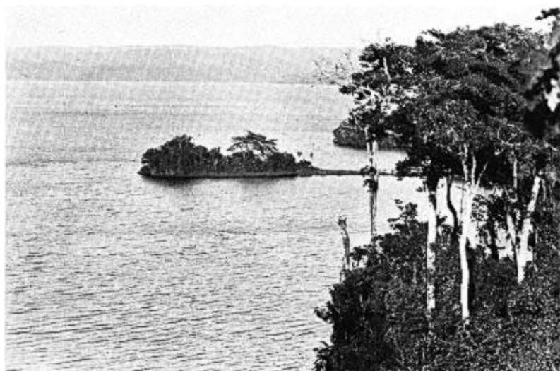
FIGURE 3. Gatun Lake and the Panama Canal as seen from the laboratory..