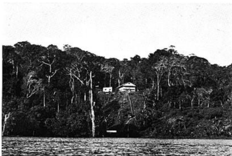
FIGURE 2. The laboratory buildings of the Barro Colorado Island Biological Station. (Photo by Walter E. Hastings).