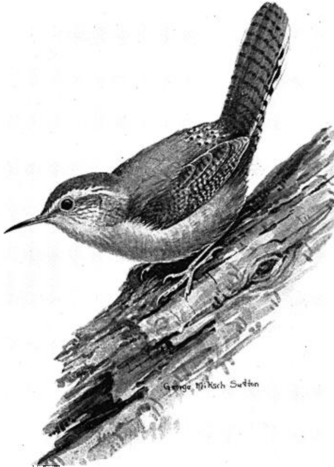
BEWICK'S WREN (Life Size)

wren is responsible for ousting the Bewick's Wren in this region it may be the Carolina Wren. The Bewick's Wren seems to be an altogether inoffensive, rather unobtrusive creature though I confess I