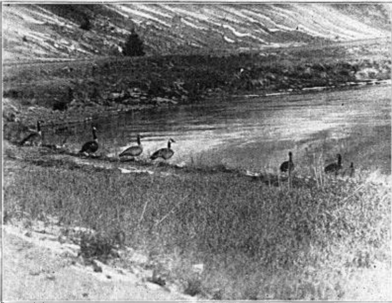
Canada Geese Picking Gravel on the Yellowstone River

Geese and the air resounds with their silvery "honk-ah-honk". Then those geese that go north, depart, and only the birds that breed in the Park remain behind. But even so, Canada Geese are fairly numerous throughout the summer, for probably as many as four hundred pairs nest each year within the limits of the Yellowstone National Park. The return migration from the north begins to arrive very regularly about September tenth, reaches its height forty days later, about the time the smaller lakes freeze, and then declines. The winter residential number of Canada Geese is about two hundred, although varying widely in different years.