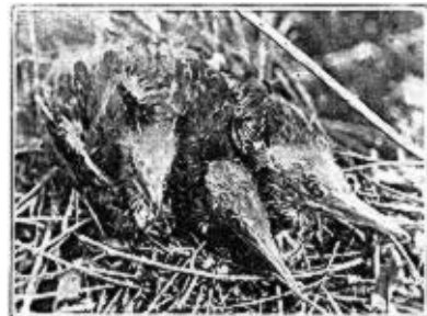
Young about ten days old