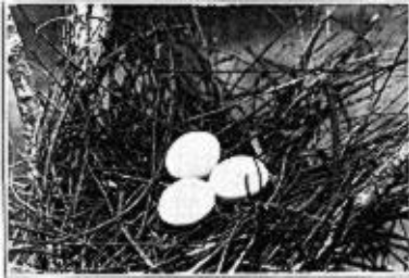
Green Heron Nest and Eggs