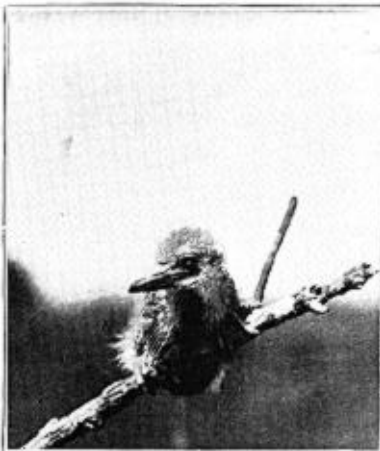
Nestling too young to perch well