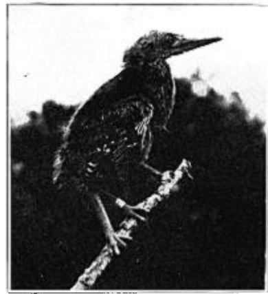
Banded young, ten days old