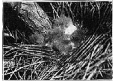
Nestlings one day old