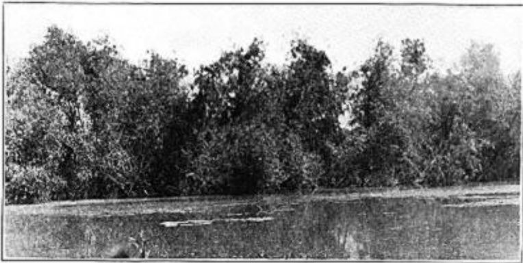
Willow Marsh, Site of the Green Heron Colony

when evidently only a few days old, perched on branches several feet from the nests. Several broods were found that were not accessible for capture and banding. When captured the very young birds usually made but little struggle for freedom. The older ones, however, scrambled away at the first opportunity and took to the water, swimming rapidly until they reached a willow where they would scramble awkwardly to the very top. With no effort at all they would move from one willow to another, climbing ever upwards until out of reach. All, except the newly hatched ones, stretched their necks at full length either moving their heads in different directions or remaining motionless. A quick motion toward them brought a darting, snapping re-