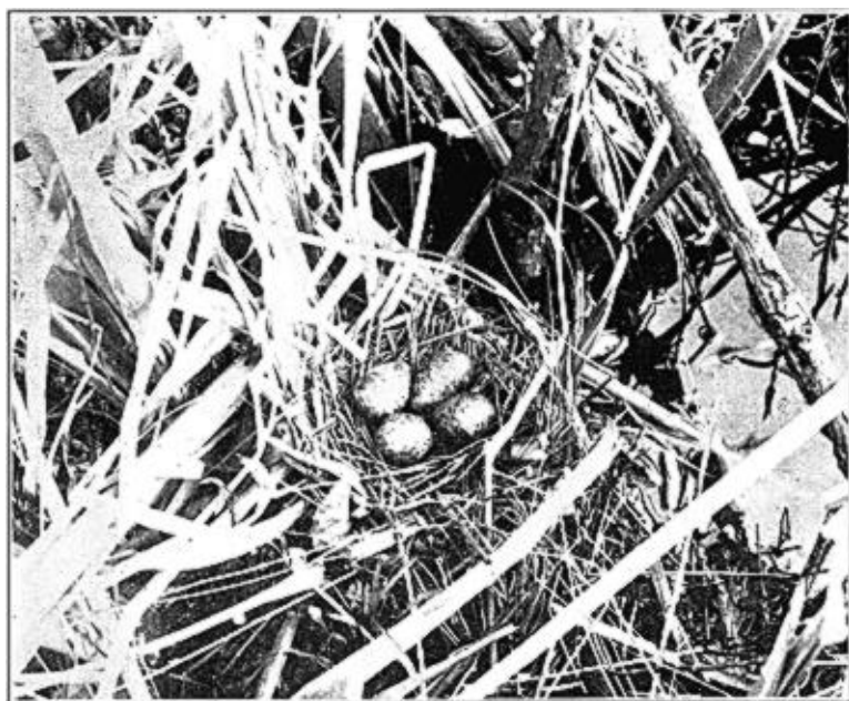
Nest of Wilson's Snipe. (No.2).

progress, was difficult, because the depth of the water varied greatly, and it was impossible to tell from the surface just how far down the next step would take one. It was no unusual thing for the water to go over my hip-boot tops. As is usually the case, at least in my experience, the female bird flushed at a time when all thoughts of a Snipe's nest were for the time being abandoned. She left not in a great hurry, and in doing so,