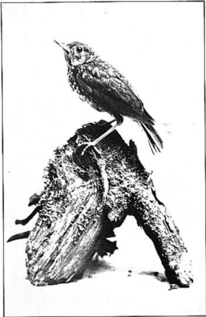
Hermit Thrush, twenty days old