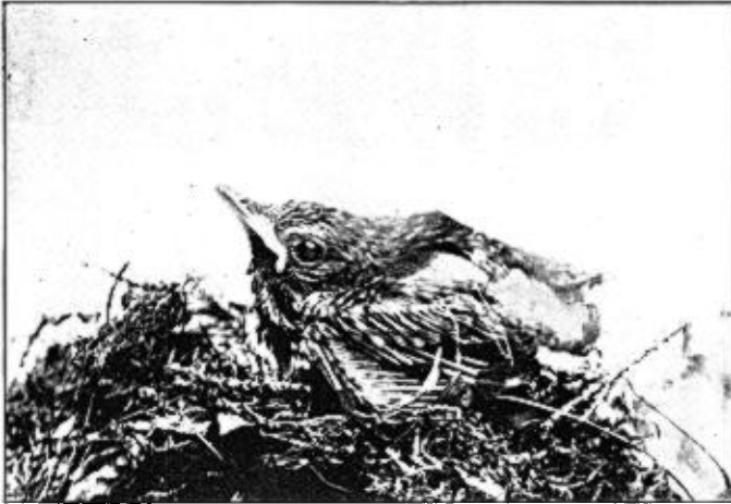
Hermit Thrush, about seven days old