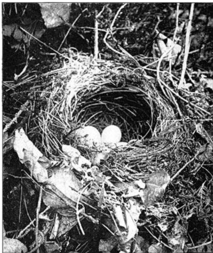
Nest of Hermit Thrush