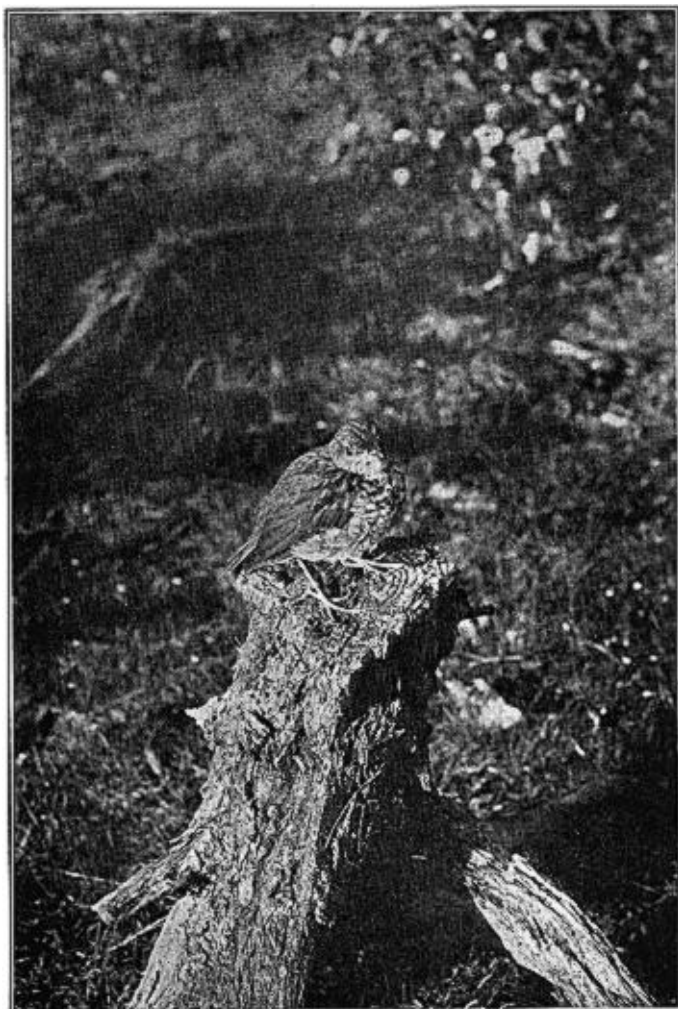
TAME HERMIT THRUSHES.