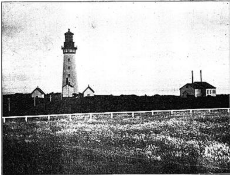
Destruction Island Light.

the burrow. Snakes and predaceous animals which could enter the burrow would find nothing to eat at other times than the nesting season of the birds. It is therefore reasonable to suppose that this burrowing sea bird may live for ages on this isolated bit of land and multiply its generations.