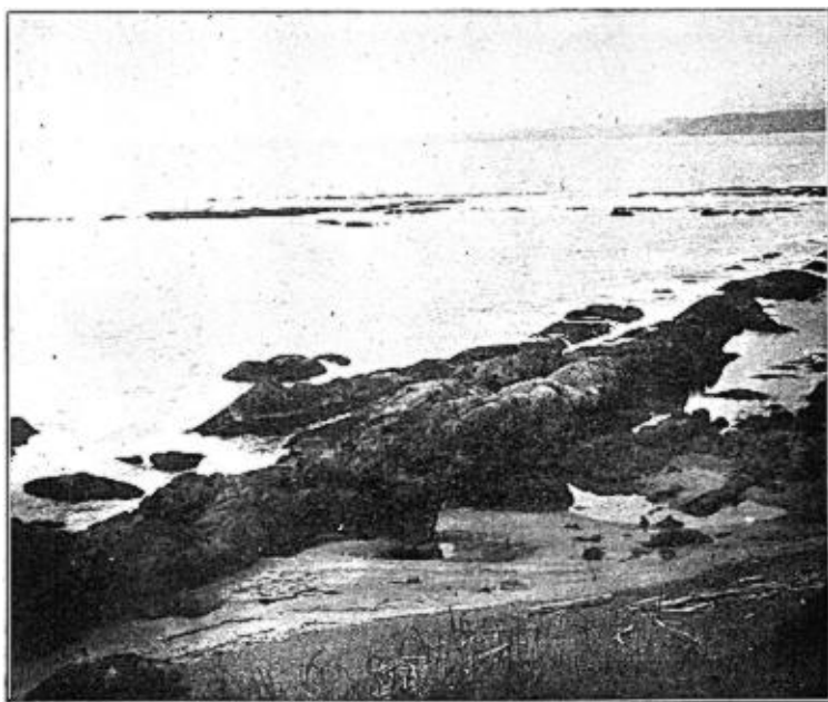
Destruction Island reefs: the mainland in the distance.

perches upon the outlying rocks, but apparently few of them were breeding birds. An occasional Western Gull was seen among the rest.