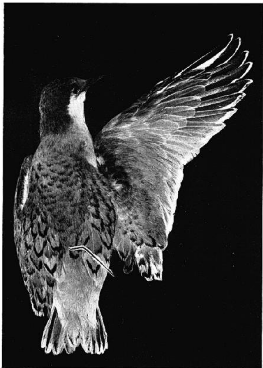
Roseate Tern ( Sterna dougalli ) Juvenile Plumage.