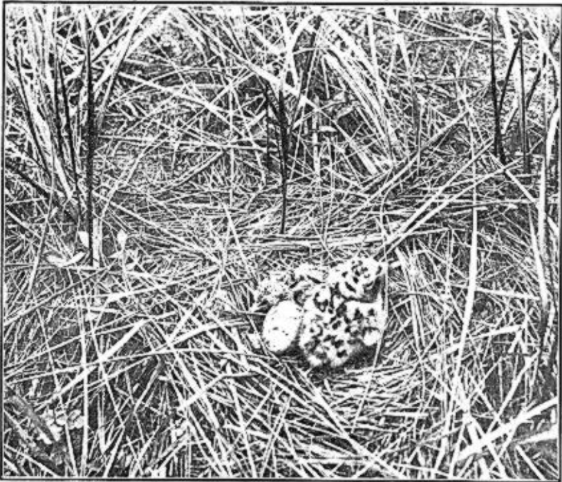
COMMON TERN. ( Sterna Hirundo .) Egg, Young Just Hatched, Young Two Days Old. Woepecket Id., Mass.

clear that two females had laid to the same nest. This was proved by the marked difference in the degree of incubation of two or three of the eggs from the rest in the nest, or by the marked difference in size and markings and texture of the shell. In a relatively small proportion of cases nests containing four eggs were clearly mixed sets. While many nests contained but one egg, I never met with a case where the single egg could be regarded as a nest complement. Either another or other eggs were laid in the nest later, or the nest proved to be deserted, or the egg was infertile and remained after the others had hatched. The usual number of eggs or young was