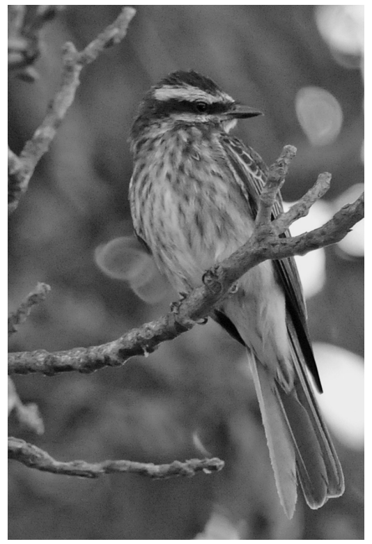
Figure 1. Variegated Flycatcher at Windust Park, Franklin County, Washington, on 7 September 2008. Note the juvenile outer rectrix projecting outward.

and October, three for March and April (Pranty et al. 2008). The Streaked Flycatcher is a migratory species that ranges from northeastern Mexico to Argentina (Howell and Webb 1995), and the Crowned Slaty Flycatcher is an austral migrant that breeds south of the Amazon River from eastern Brazil and northern Bolivia to central Argentina and Uruguay and winters north to southern Venezuela and Colombia (Hilty 2003). The Streaked Flycatcher has yet to be recorded north of Mexico, but a Crowned Slaty Flycatcher was collected in Cameron Parish, Louisiana, on 3 June 2008 (Conover and Myers 2009).