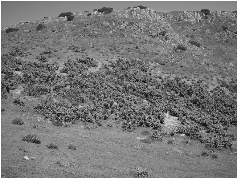
Figure 3. Cholla patch on south-facing slopes below Mesa Jesús María, 9 March 2005. A pair of Cactus Wrens was observed nesting in this patch.

Image Source: Copyright Globe Xplorer, All Rights Reserved (flown April 2007)