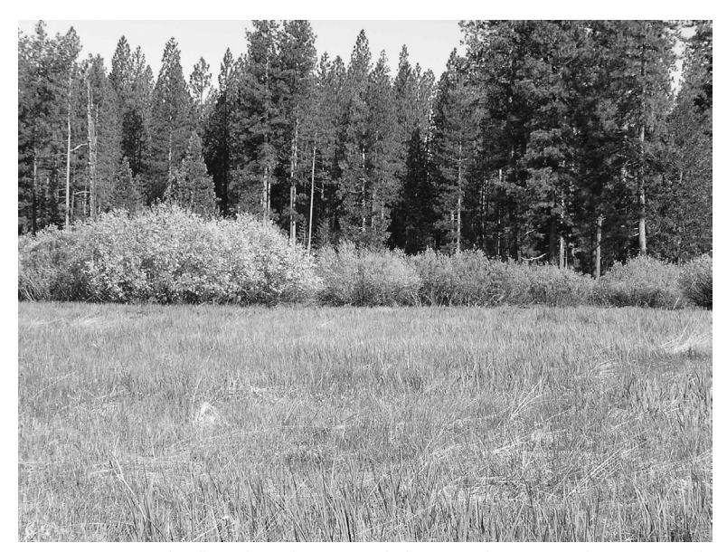
\label{eq:Figure 2.} Figure \ 2. \ Potential \ Willow \ Fly catcher \ nesting \ habitat \ at \ Ackerson \ Meadow, just outside \ Yosemite \ National \ Park.

Bombay et al. (2000) reviewed the Willow Flycatcher's nesting habitats in the Sierra Nevada. The species nests most typically in willow thickets in or adiacent to low- and mid-elevation meadows or riparian stringers covering at least 0.4 ha, usually considerably more (Figure 2). Nests have also been found in willow thickets adjacent to lakes, marshes, and creeks. Less frequently, Willow Flycatchers have nested in patches of riparian deciduous shrubs other than willows. Nesting areas, at least in the early part of the breeding season, generally are characterized by extensive surface water (Harris et al. 1988. Sanders and Flett 1989, but see also McCreedy and Heath 2004) and substantial openings, either large and continuous or small and numerous, in the forest canopy. The micro-site used for nesting is typically a patch of shrubs 2-4 m tall, with a high density of leaves (Sanders and Flett 1989, Bombay 1999). Historical records from the Yosemite area suggest Willow Flycatchers bred commonly in the park below 1525 m and less frequently at higher elevations (Gaines 1992). The highest recorded breeding pairs in the park were observed at around 2150 m (Gaines 1992), consistent with Bombay's (1999) suggestion that the upper elevation limit of breeding habitat is determined by the presence of snow and leafless willows at the time of spring arrival.