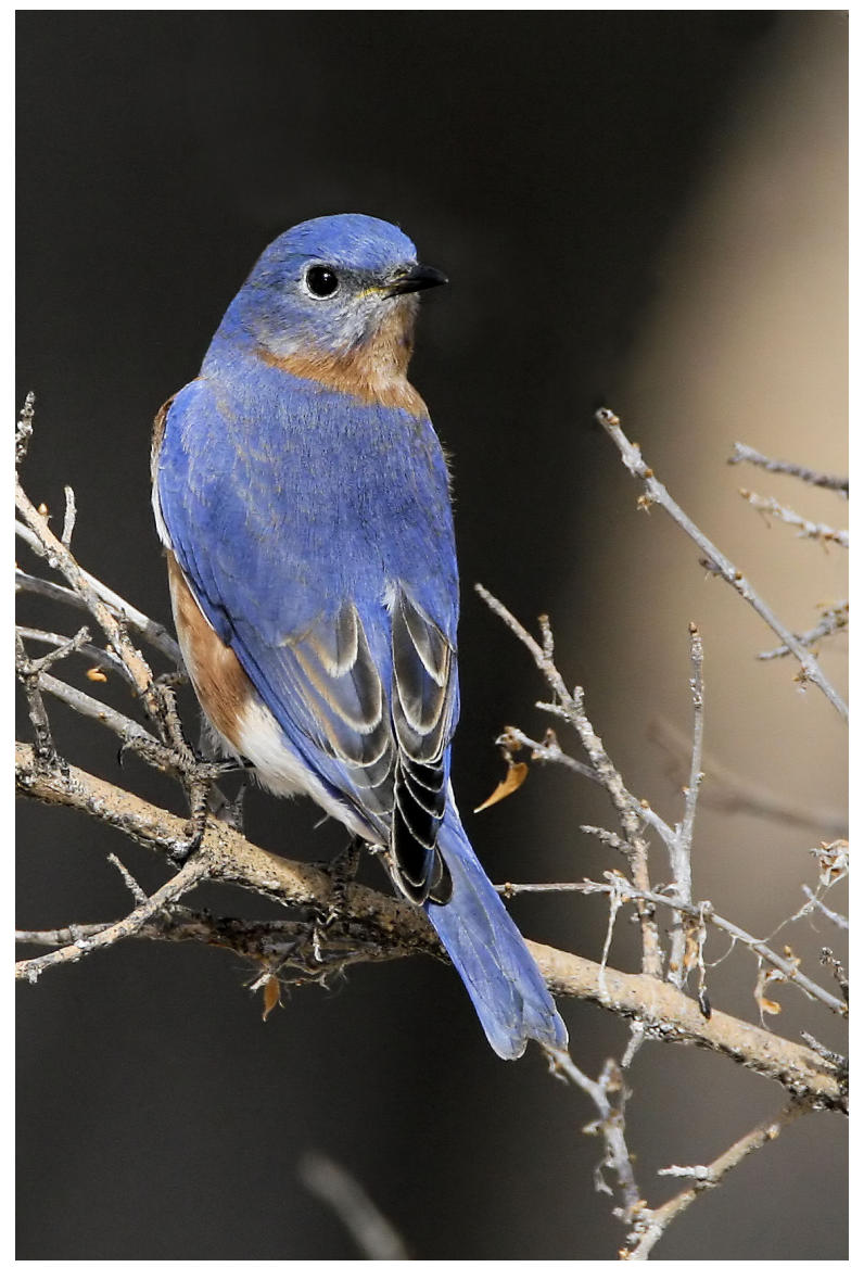
Figure 1. Male Eastern Bluebird in bosque along Rio Grande at Albuquerque, New Mexico, December 2006\,