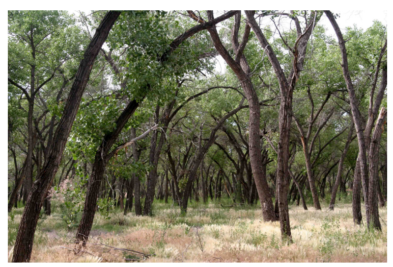
Figure 5. Example of Eastern Bluebird nesting habitat in bosque along the middle Rio Grande. Although this nesting habitat is quite variable, it is always characterized by the absence of an understory of shrubs.