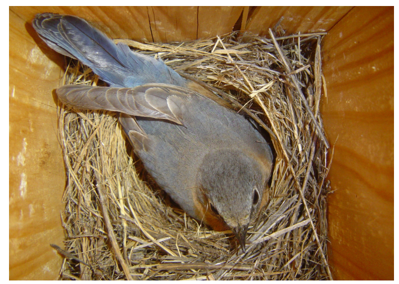
Figure 4. Female Eastern Bluebird incubating in a nest box at Albuquerque, New Mexico.