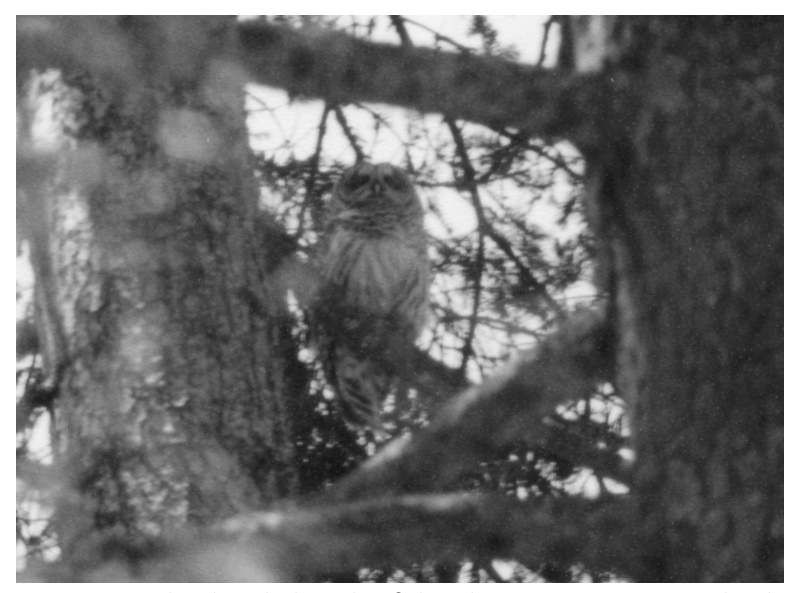
Figure 2. Barred Owl perched on white fir branch in Kings Canyon National Park, California, 3 June 2004.