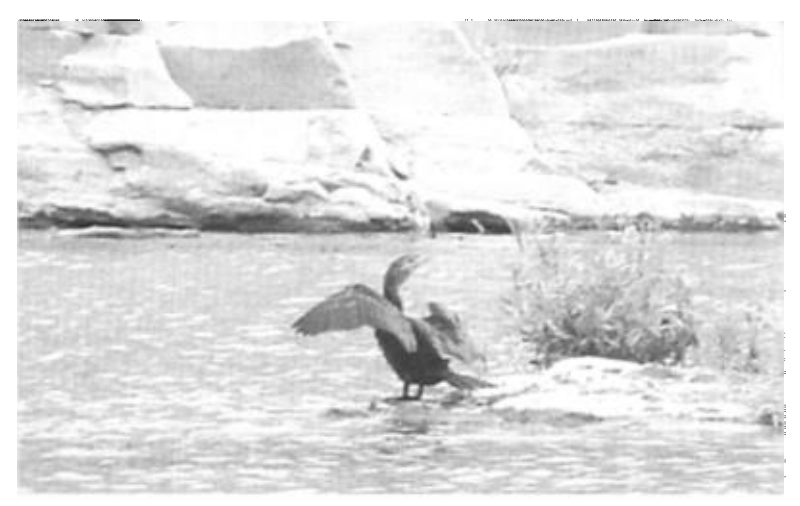
Figure 1. Neotropic Cormorant in the Ojo de Agua at Río La Purísima, Baja California Sur, 7 February 2003.

The Neotropic Cormorant, also called the Olivaceous Cormorant, is easily distinguished from the Double-crested Cormorant ( Phalacrocorax auritus ) by its smaller