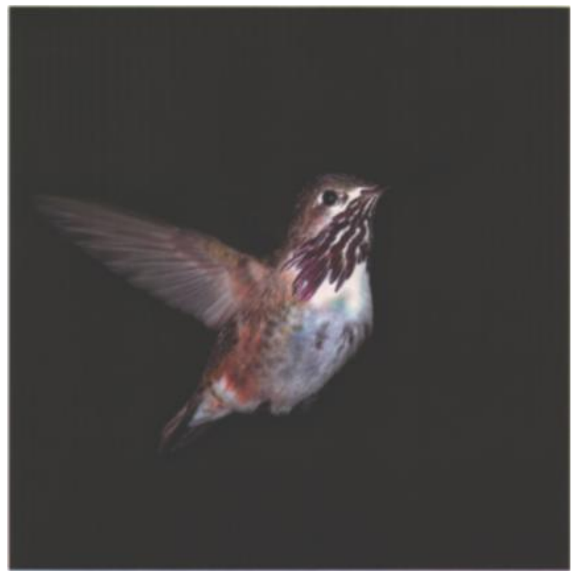
Calliope Hummingbird ( Stellula calliope ) Granite Bay, California, April 2003 (feeder digitally removed)