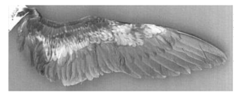
Figure 1. Ventral view of the wing of the Long-billed Murrelet specimen (Charles R. Conner Museum [Washington State University] no. 01-37) found dead in eastern Washington state on 14 August 2001.

of the throat all the way to the base of the neck are pale.... In contrast, Marbled Murrelets do not show pale sides to the throat" (Lethaby 2000). In the hand, but to a lesser degree in the field, the most accurate plumage character for discriminating between these species in alternate plumage is the presence of "cinnamon-edged" or "rufous" feathers in the mantle and scapulars of the Marbled but not the Long-billed (Ridgway 1919, Piatt et al. 1994, Lethaby 2000).